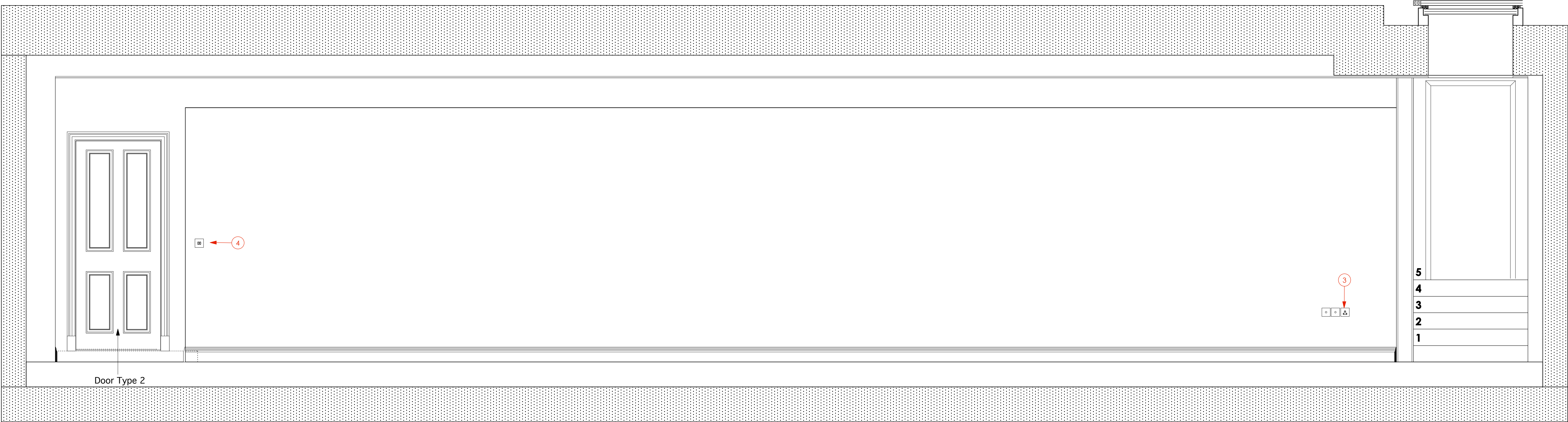
ELEVATION 2 Scale 1:50