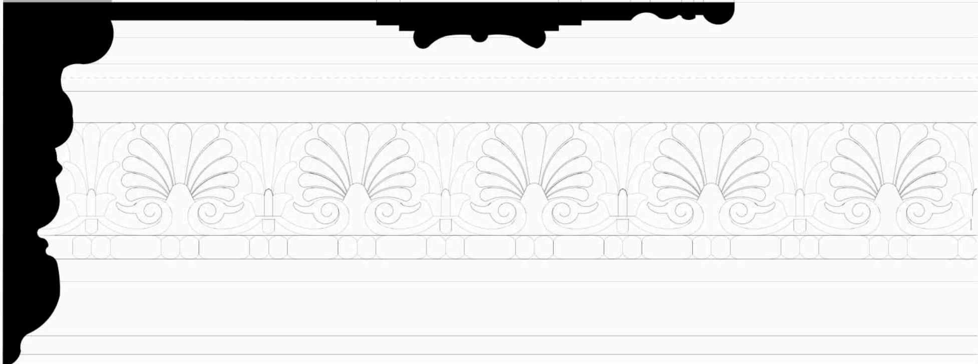
CORNICE - Profile 1a- existing (RG 10-Bar room adjacent to fireplace)