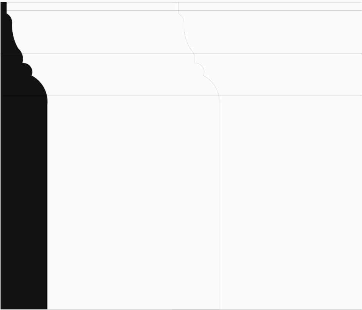
PROFILE 4- existing (RG.13 Study)