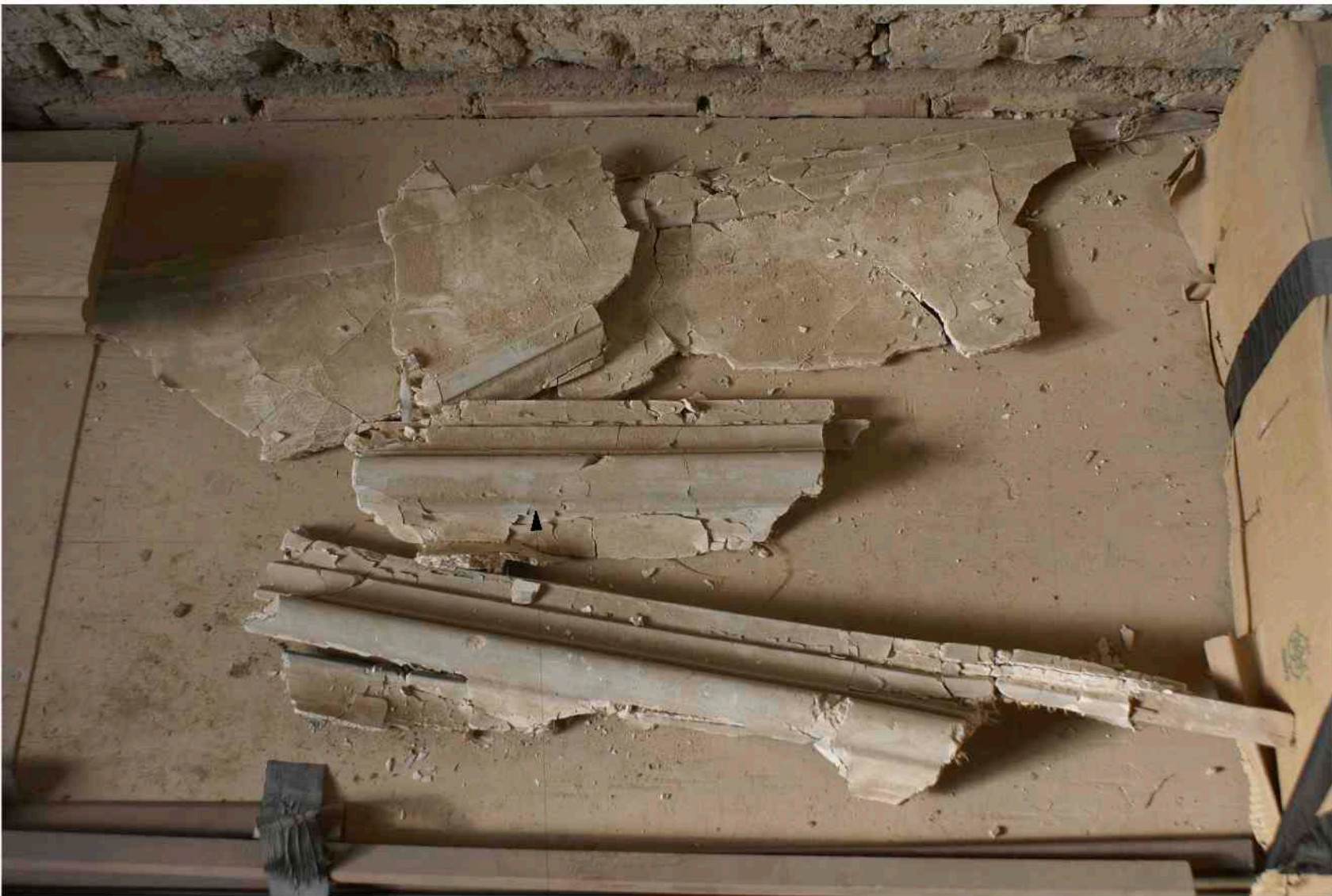
Retained mouldings from RG.13 are in a state of disrepair but currently form the basis of the proposal to reinstate mouldings to RG.13 (see profile 4)