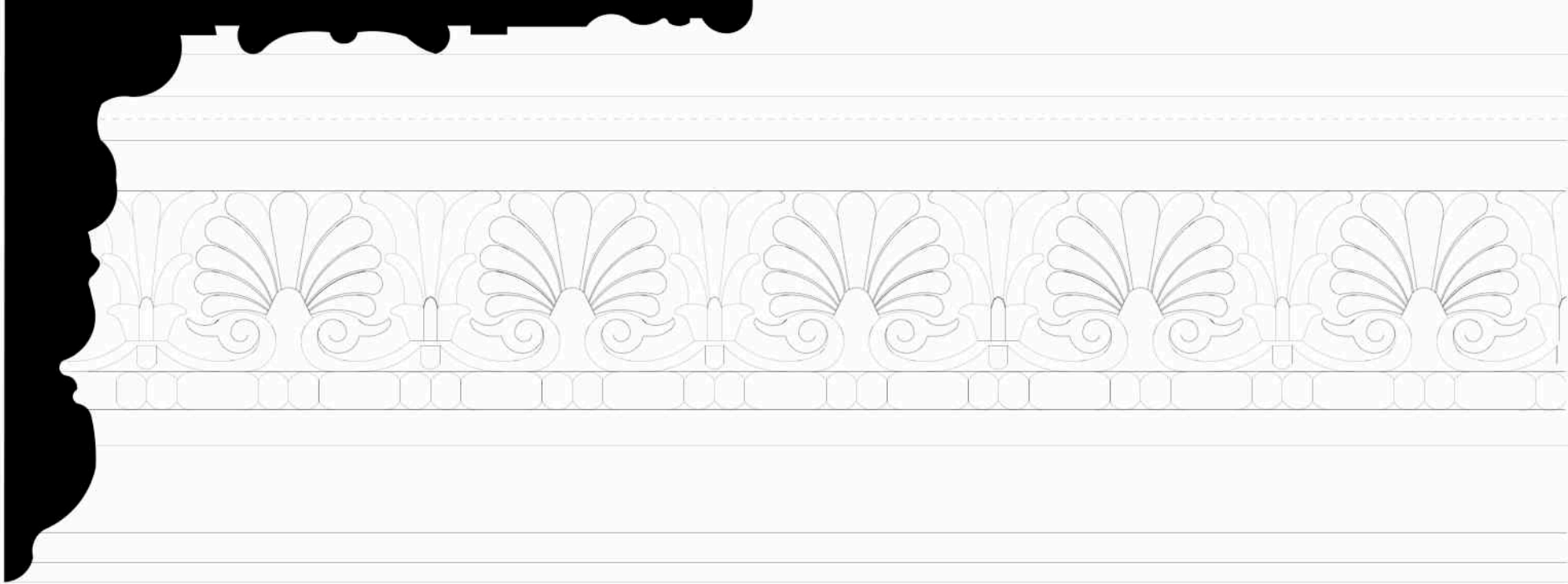
PROFILE 1- existing (RG.10 Bar room)