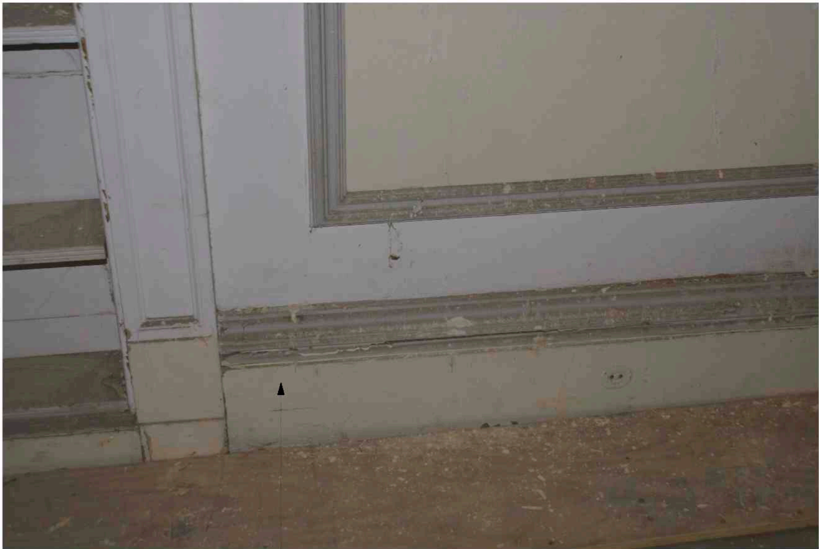
Existing skirtings in RG.10 form the basis for the design proposal to reinstate skirtings wherever possible to this profile and propose new profiles based on this skirting for basment and secondary spaces. Details/ schedule to follow with application for completion of existing works.

Extent of re-use, repair and restoration of existing mouldings and joinery currently under discussion with Conservation Area officers - see Luard Conservation Ltd Report on timber assesment. Details/ schedule to follow with application for completion of existing works.