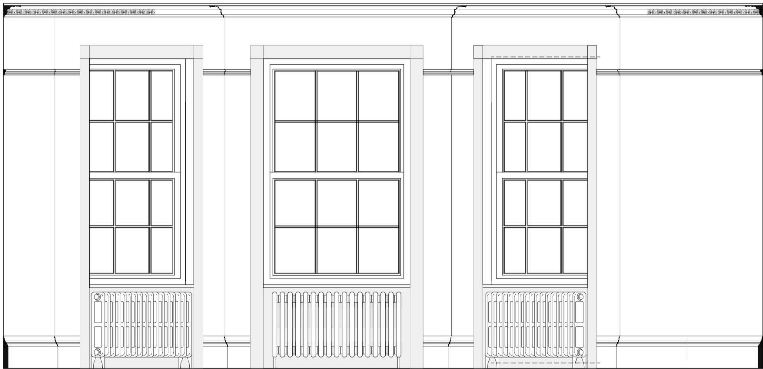
ELEVATION 4 Scale 1:20