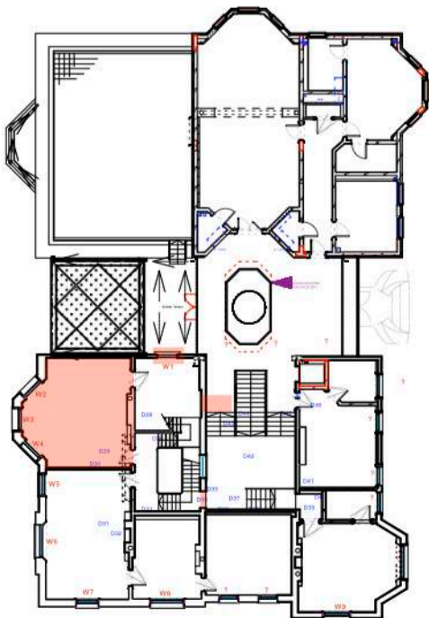
KEY PLAN Scale 1:500