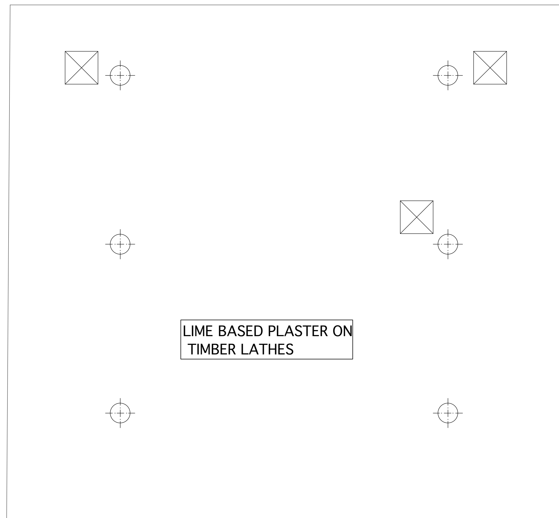
REFLECTIVE CEILING PLAN Scale 1:20