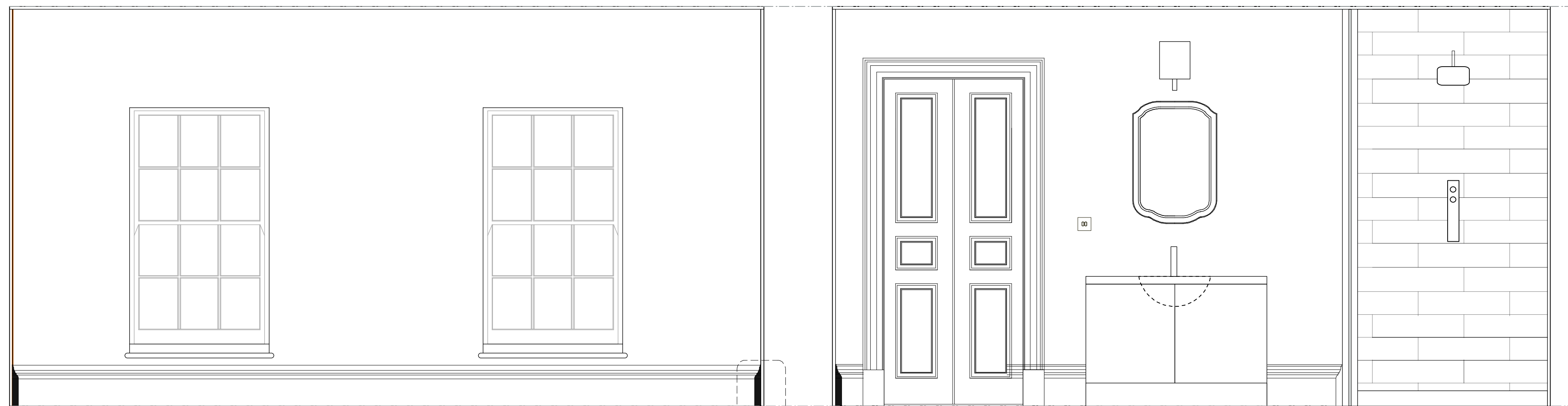
ELEVATION 3 Scale 1:20

Contractor to confirm make up of infill floor