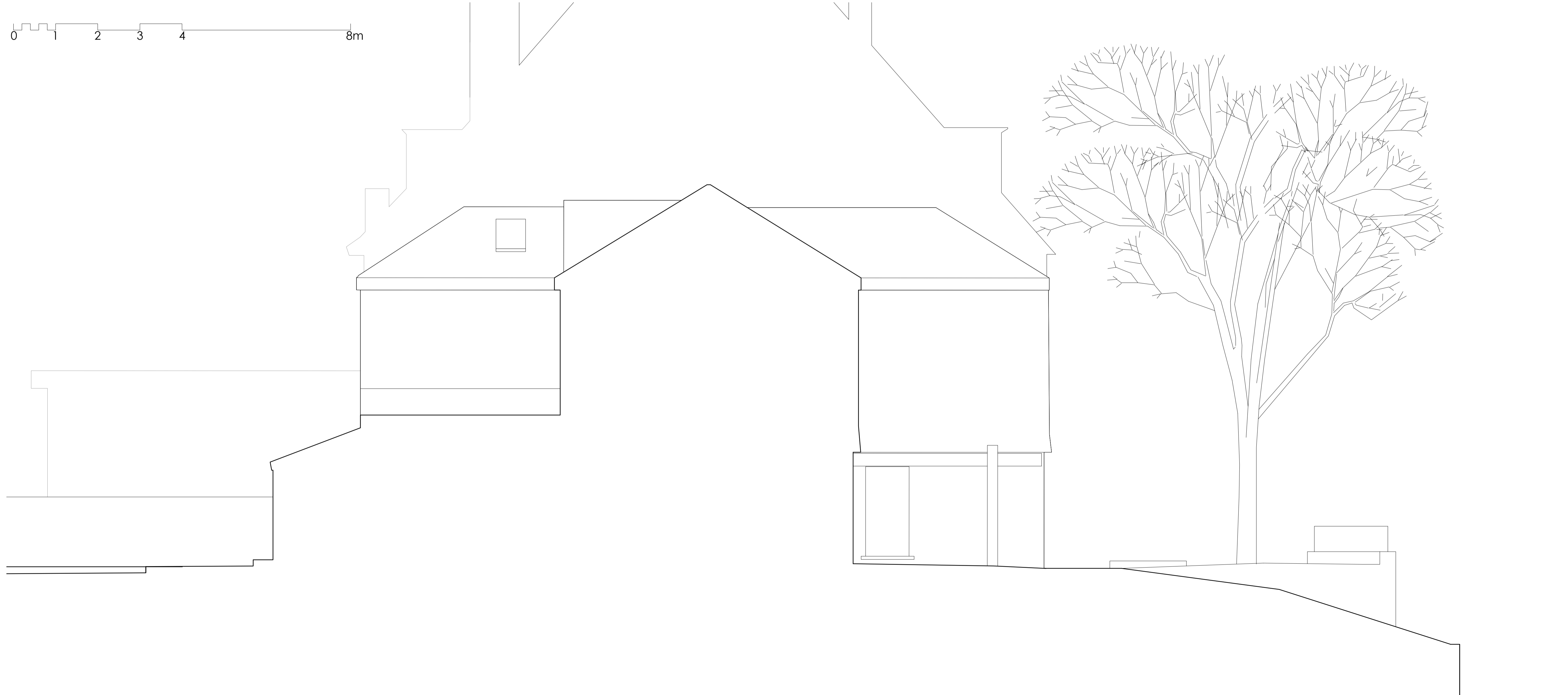
EXISTING SECTION 1:50@A1