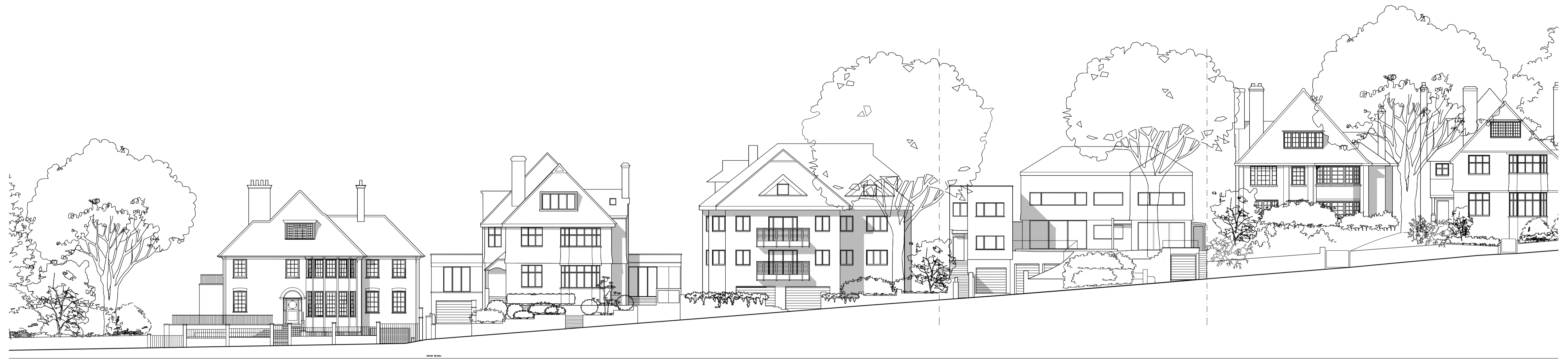
STREET ELEVATION 1:200@A1