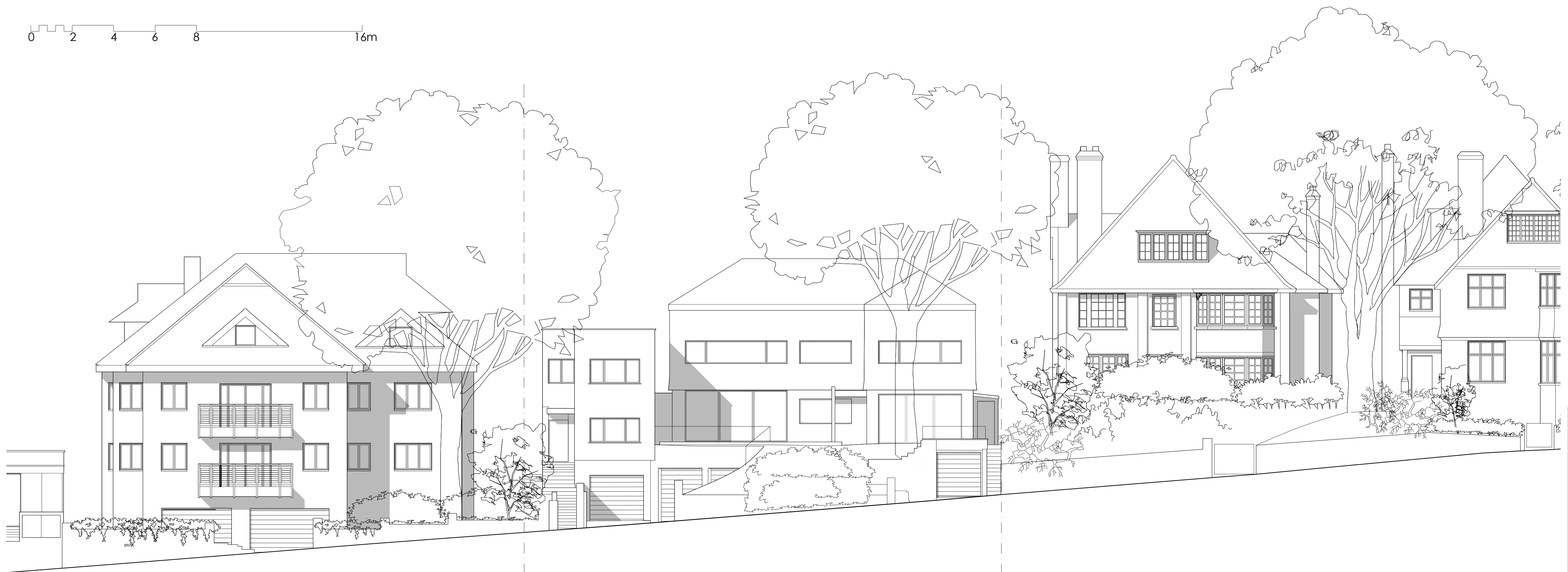
STREET ELEVATION 1:100@A1

Martin Evans Architects © 18 Charlotte Road London EC2A 3PB tel 020 7729 2474 JOB OAKHILL AVENUE LONDON NW3 7RE TITLE EXISTING STREET ELEVATIONS SOUTH-EAST (FRONT) DATE 15.05.2013 SCALE 1:100 @ A1 DRAWN S.N.D DRAWING NO. OHA-PL-EX-08