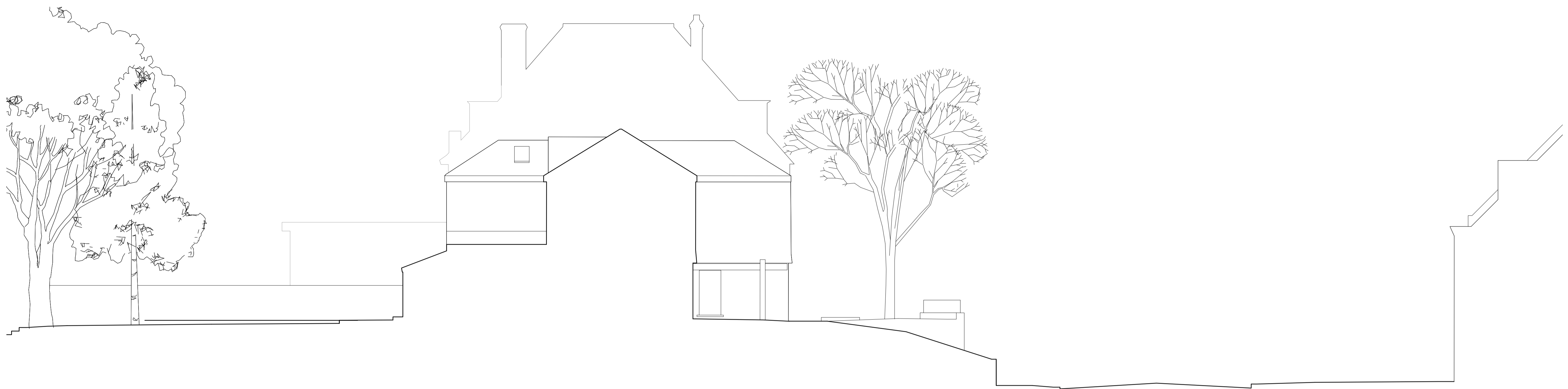
EXISTING SECTION 1:100@A1