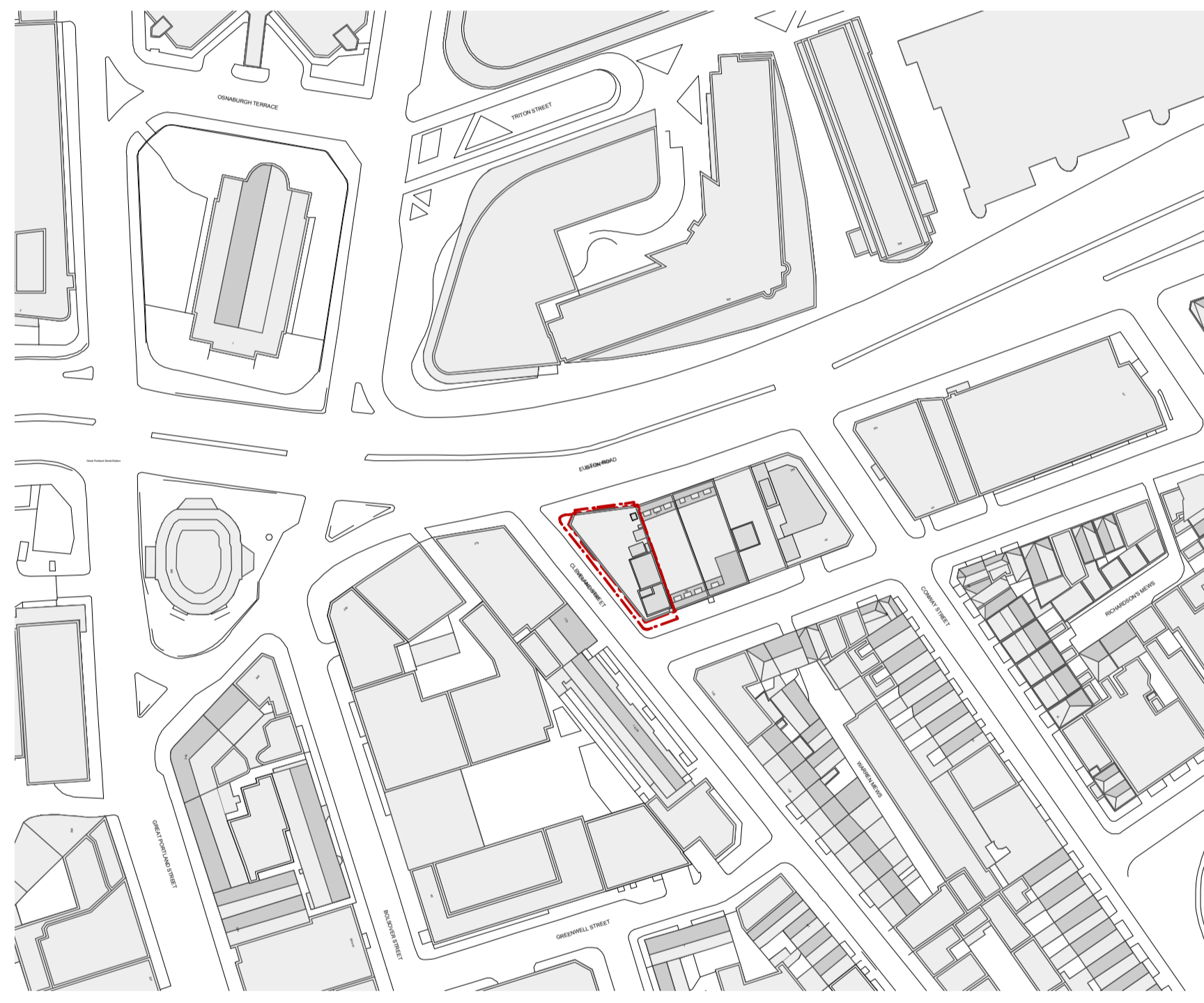
SITE LOCATION PLAN 1:1250 @ A1