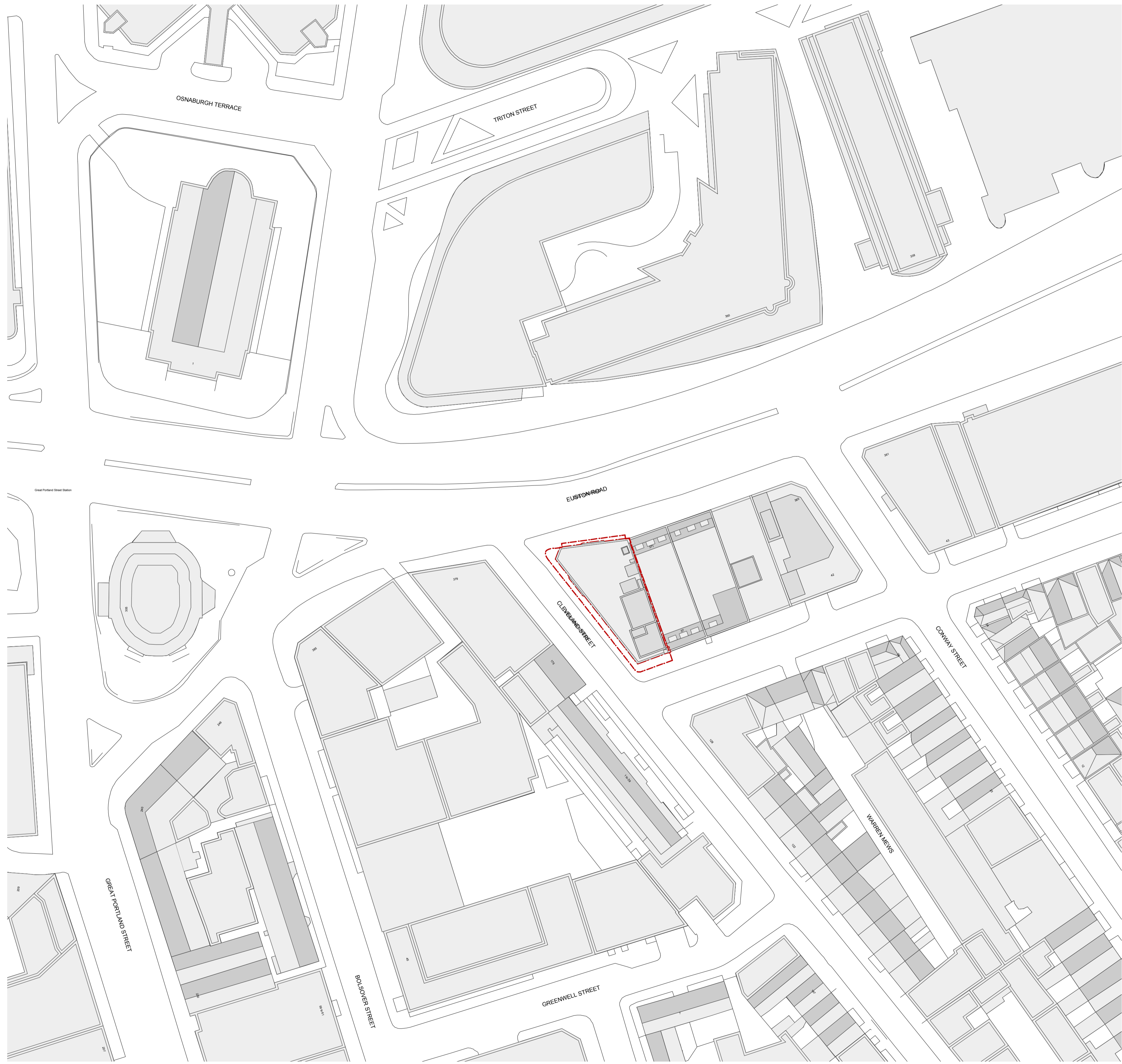
EXISTING SITE PLAN 1:500 @ A1