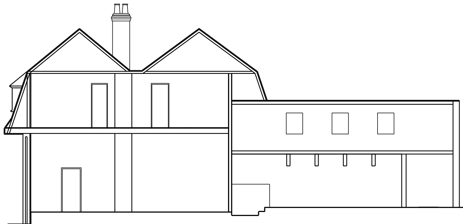
EXISTING SECTION BB