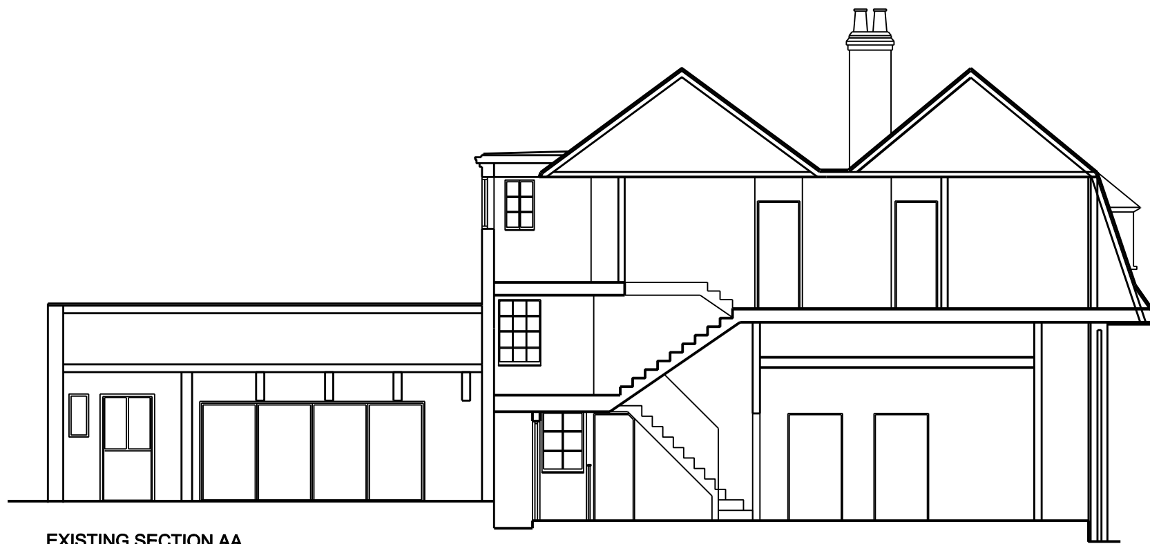
EXISTING SECTION AA