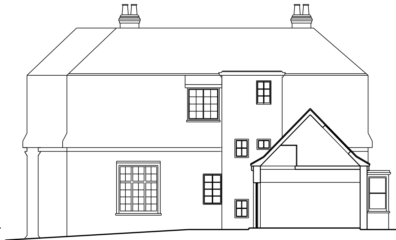
EXISTING SECTION CC