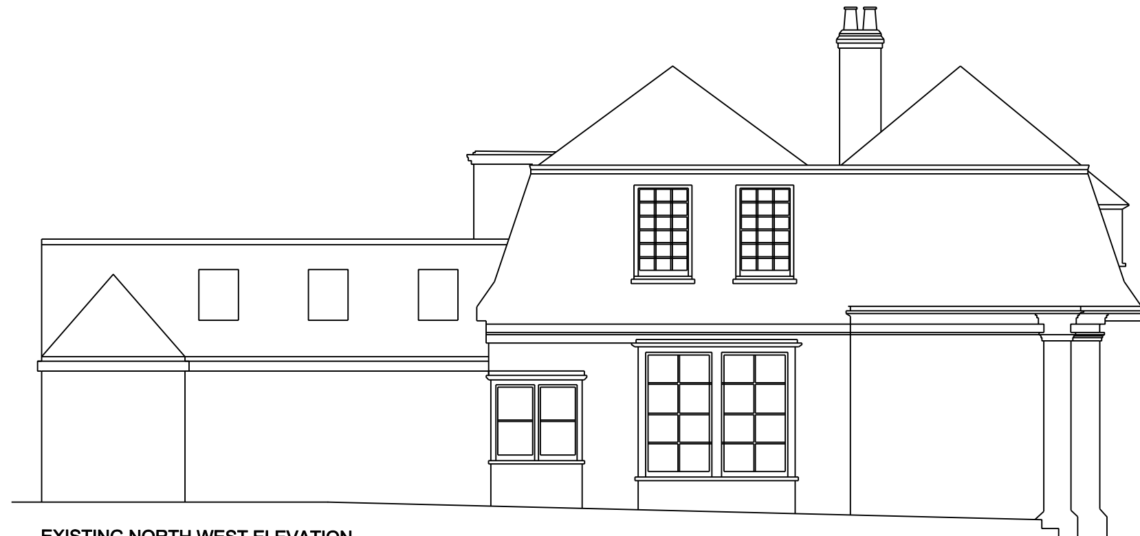
EXISTING NORTH WEST ELEVATION