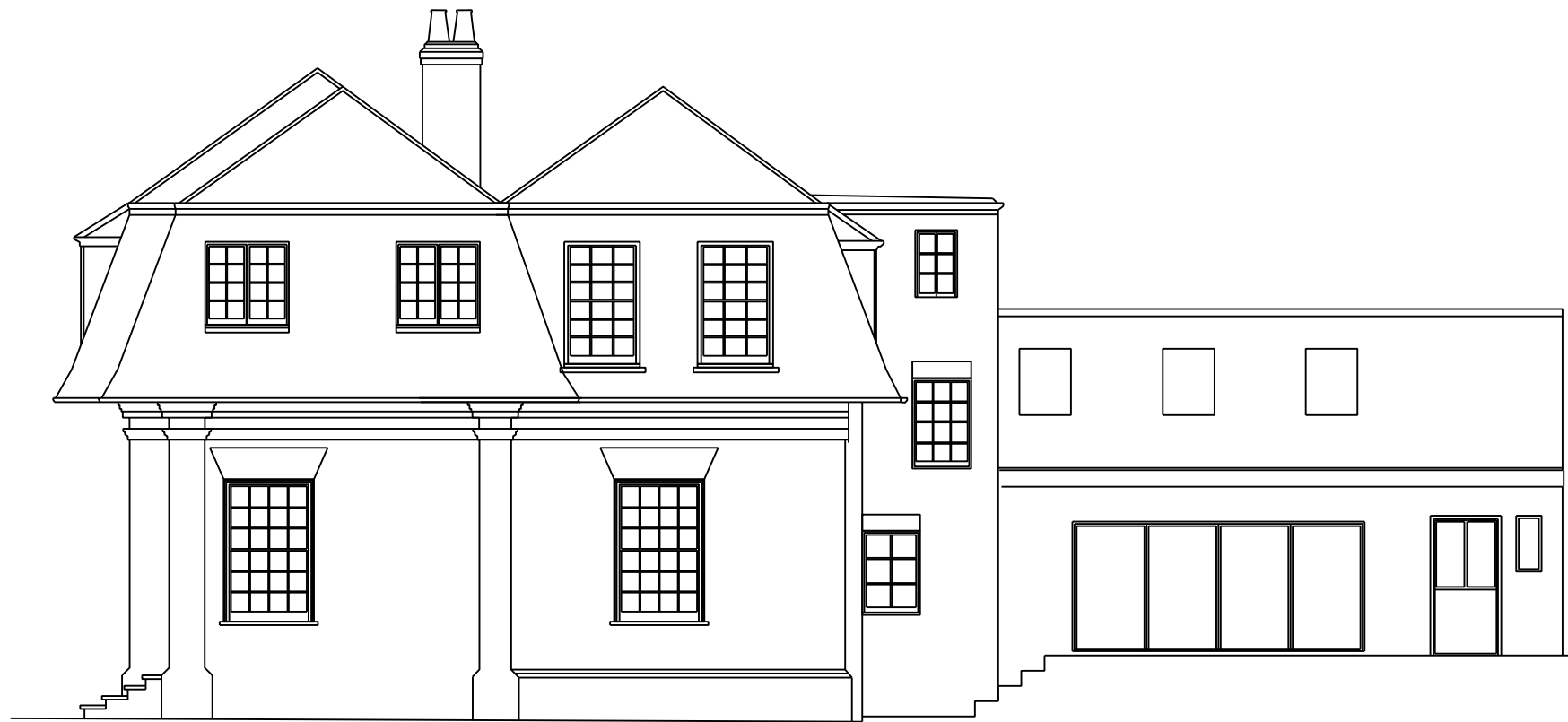
EXISTING NORTH EAST ELEVATION