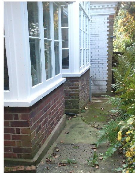
View of existing the main house (bay windows) looking from outside of the Utility Room