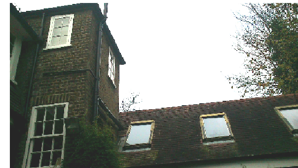
View of existing kitchen roof from garden. Existing roof lacking elegance in comparison to the main house.