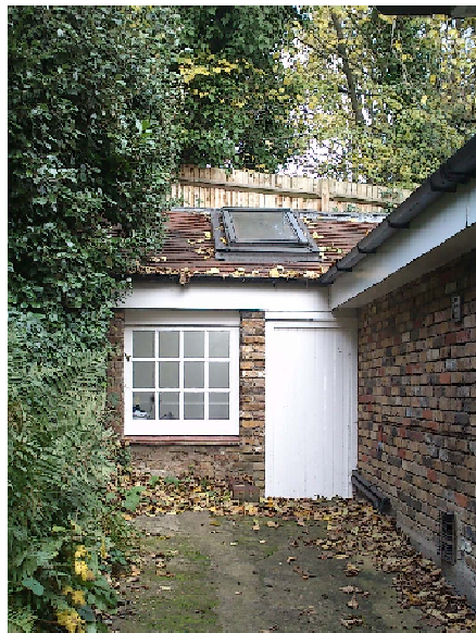
View of existing the Utility Room and Kitchen from side of house. Roof in need of repair and updating.