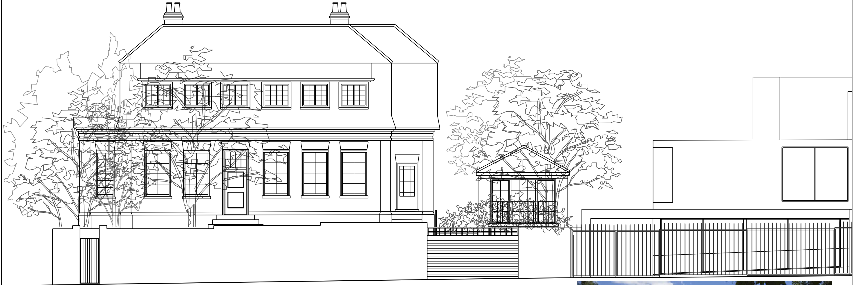
EXISTING STREET VIEW (FRONT) ELEVATION