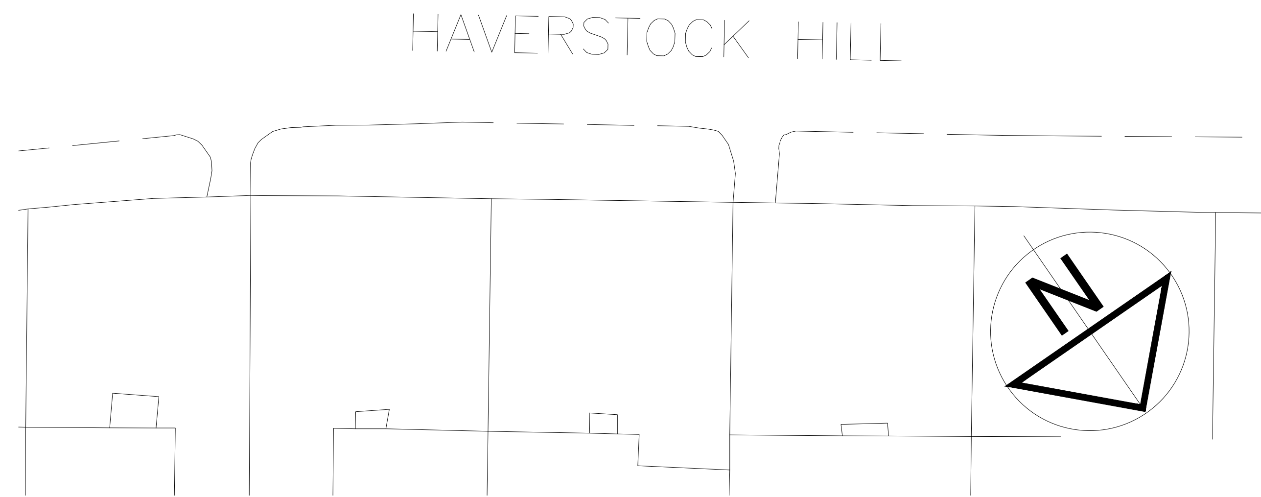
Existing Site Plan 1:200