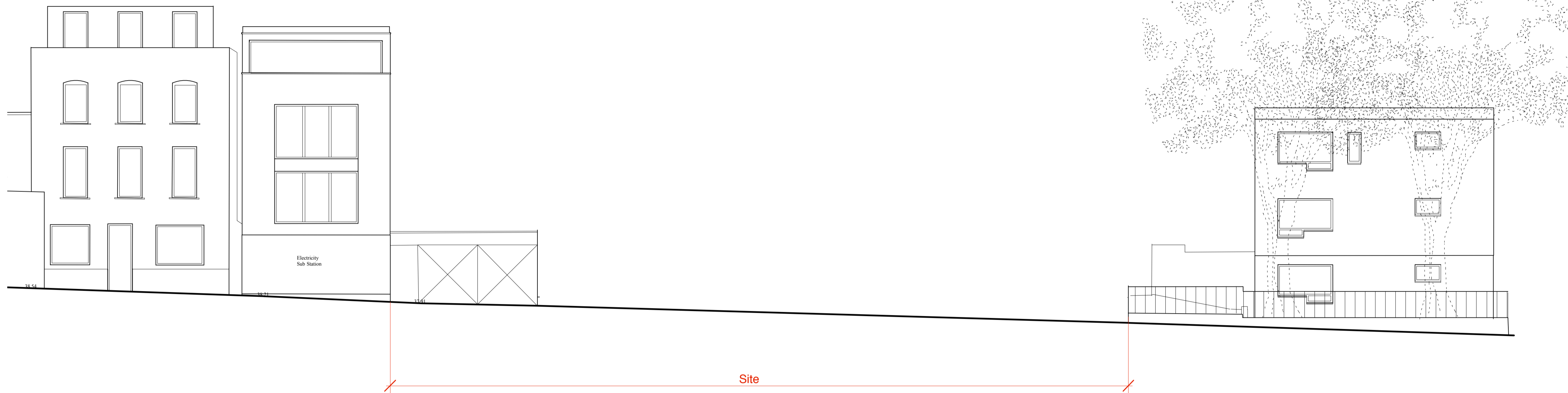
Allcroft Road Front Elevation 1:200@A3