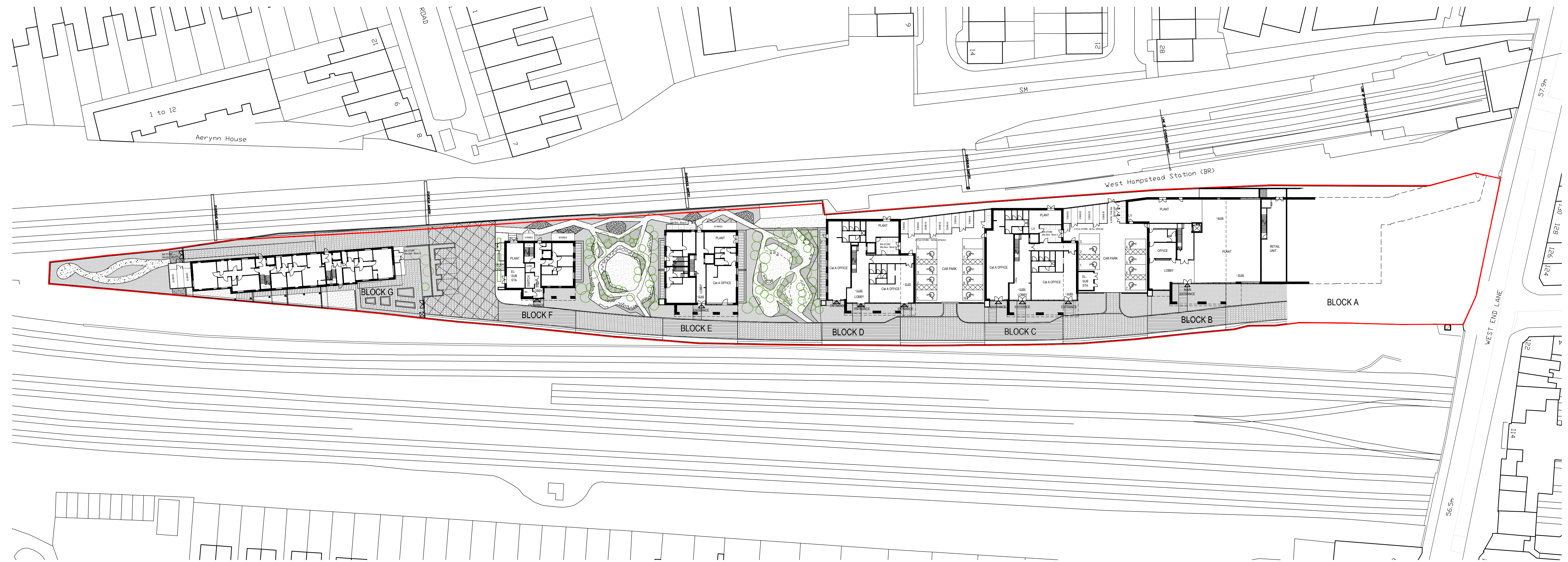
PROPOSED SITE MASTERPLAN LOWER LEVEL