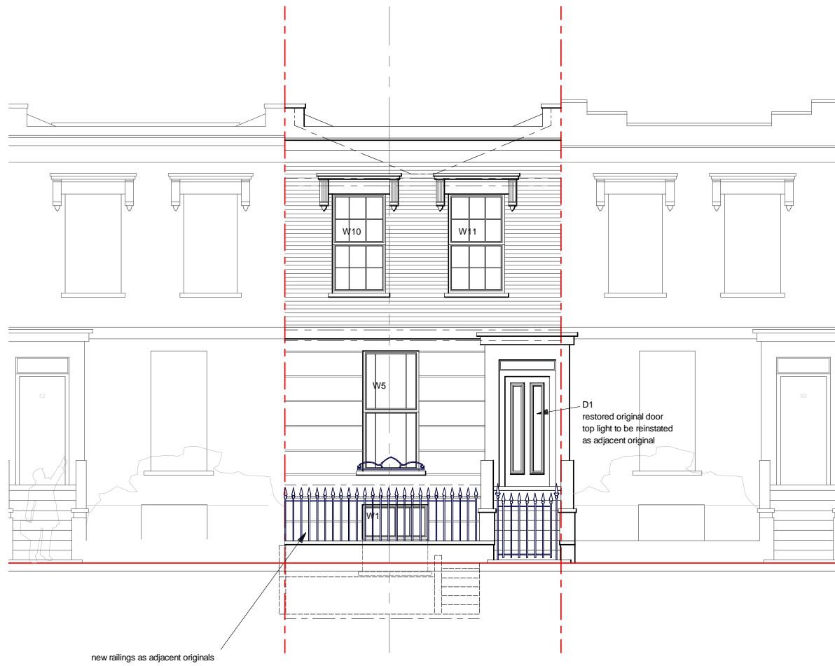
proposed front elevation