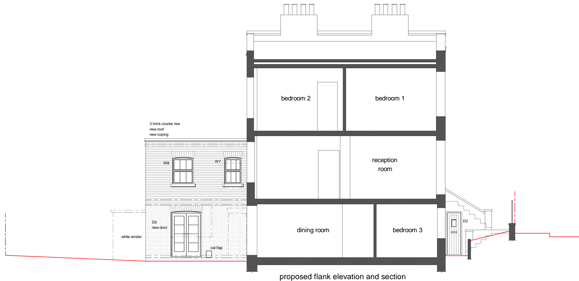
proposed flank elevation and section