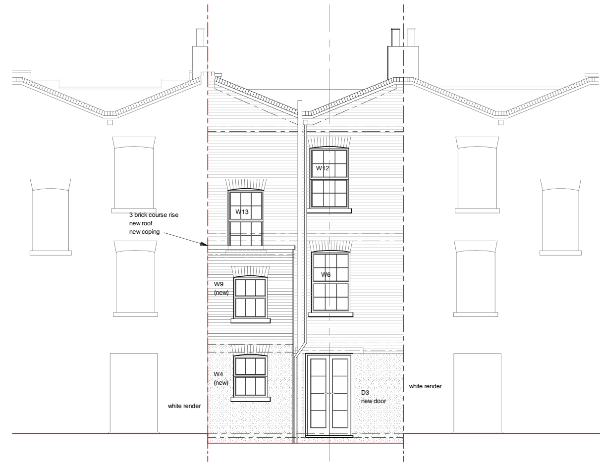
proposed rear elevation