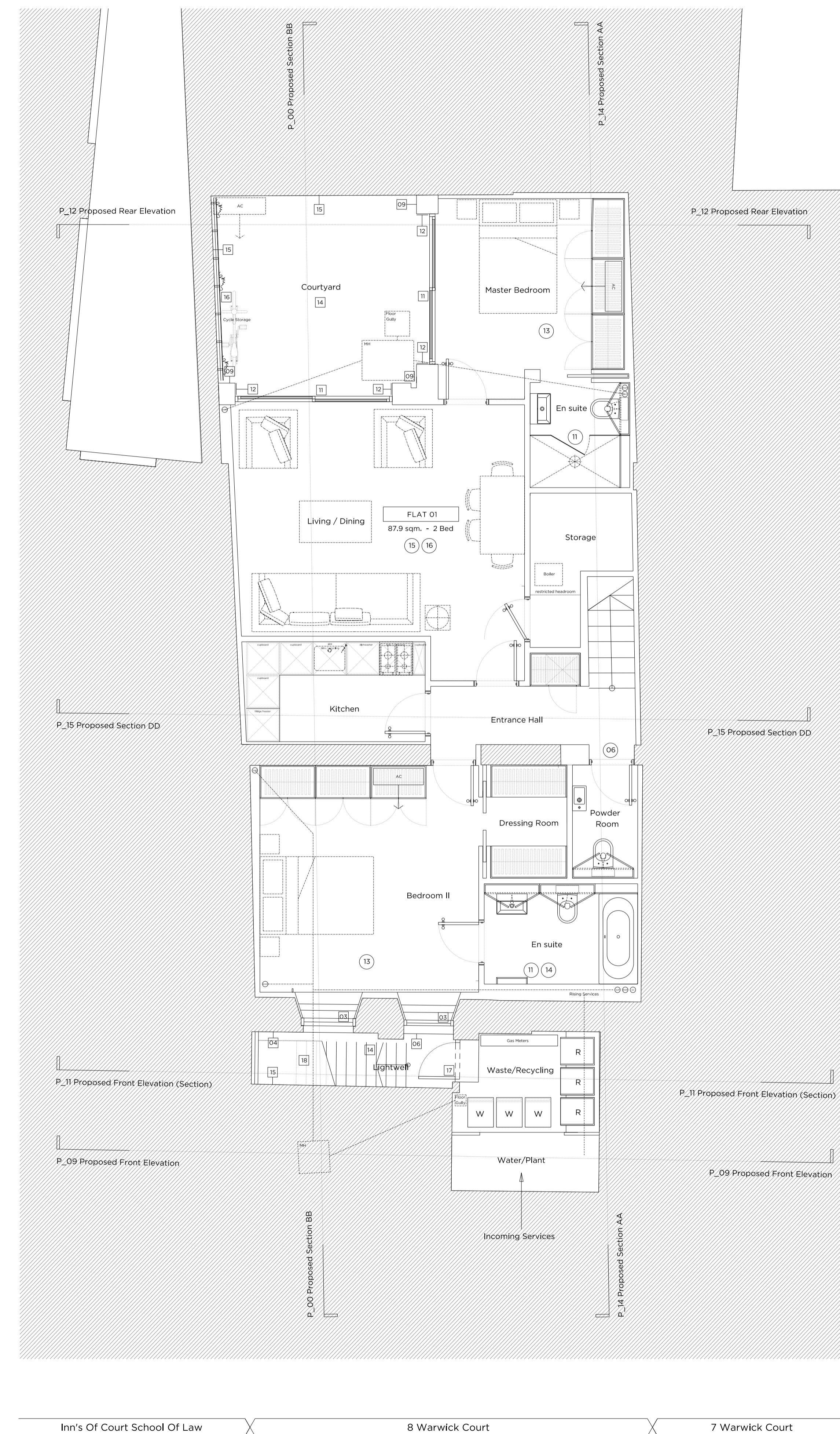
PROPOSED LOWER GROUND FLOOR