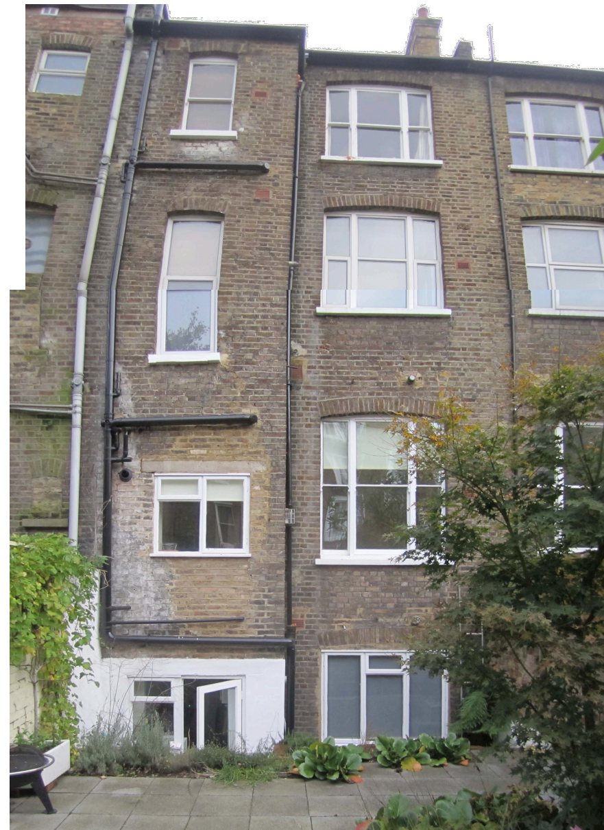
rear of 13A Maygrove road

1. do not scale, work only to figured dimensions 2. all dimensions to be checked before site fabrication 3. contractors are obliged to report all errors and omissions to designers 4. contractors to refer to engineers drawing before proceeding with works all drawings and ideas are copyright, and maynot be ditributed, copied or issued without permission