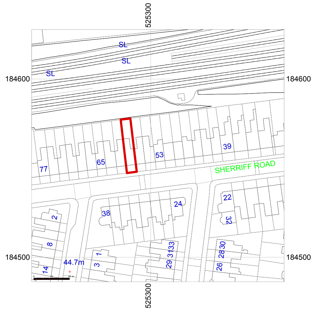
SITE LOCATION PLAN SCALE 1:1250 @ A3