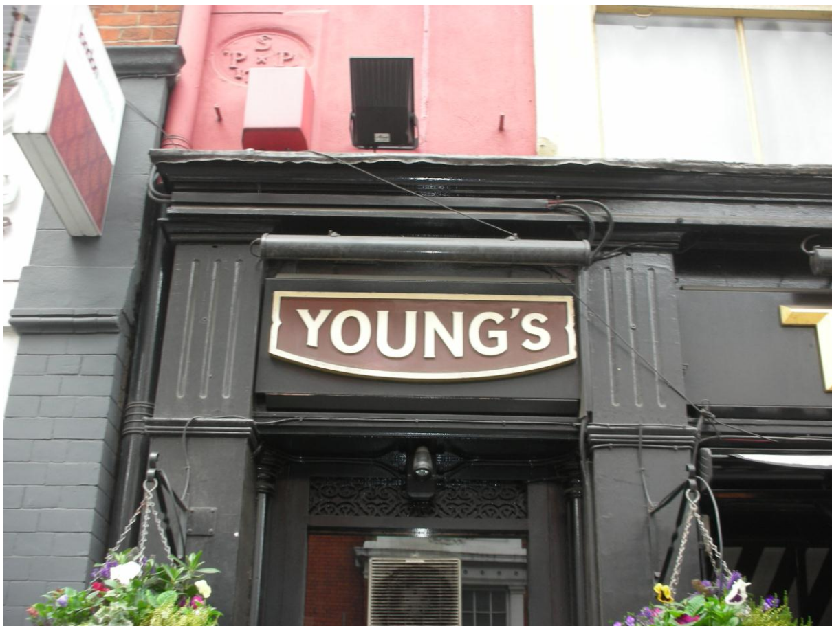
Photo C – Young's plaque to left hand side of main fascia H300, W900mm. Fascia H440, W1050mm.