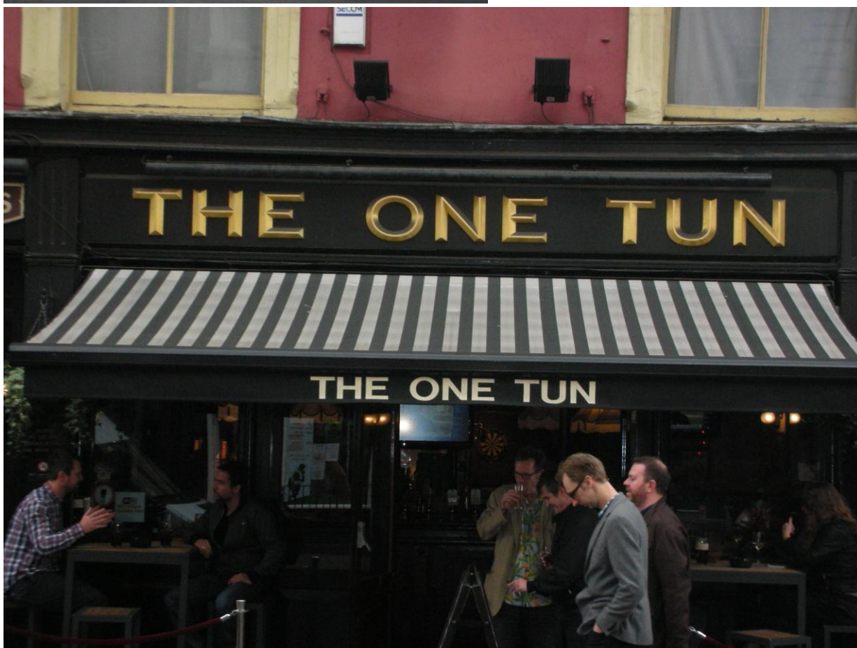
Photo B – Fascia font approx. H340, W4600mm. Fascia approx. H440, W5200mm. Trough lighting above.