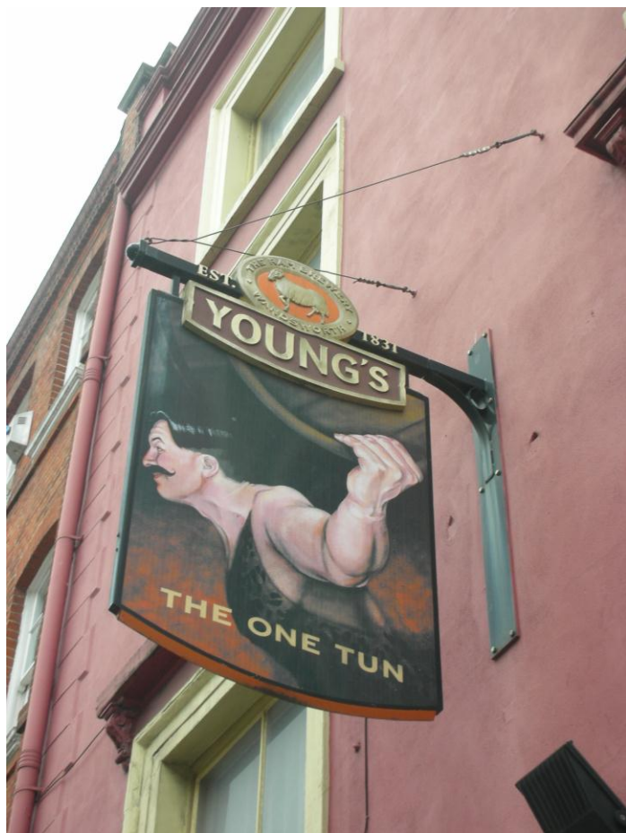
Photo E – Swing sign approx. H1200, W900mm. No illumination other than 2 floodlights nearby.