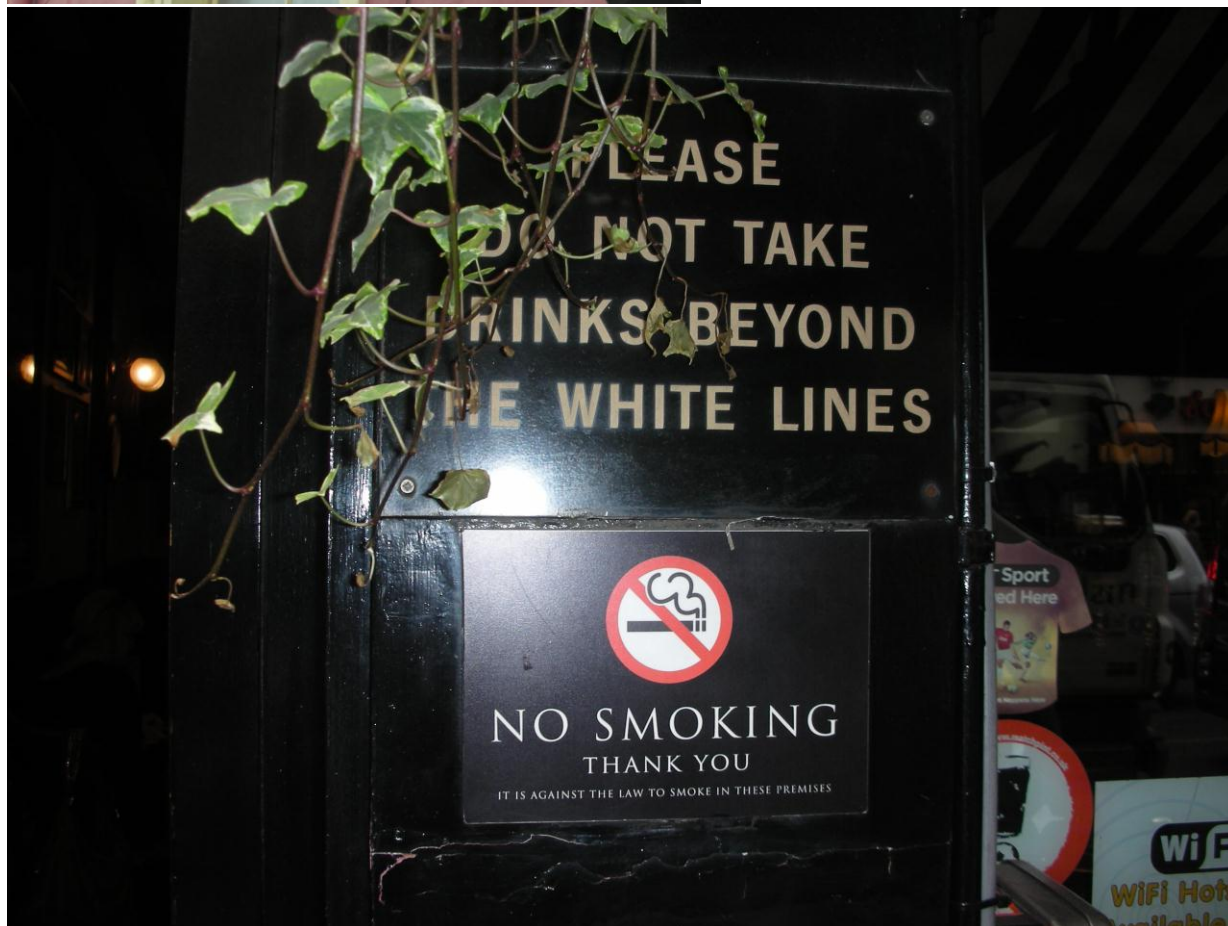
Photo F – Sign screw fixed to timber column H230, W300mm. No Smoking sign H145, W210mm.