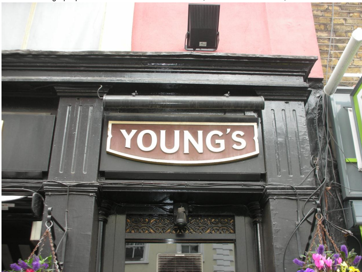
Photo D – Young's plaque to right hand side of main fascia H300, W900mm. Fascia H440, W1050mm. Trough lighting above