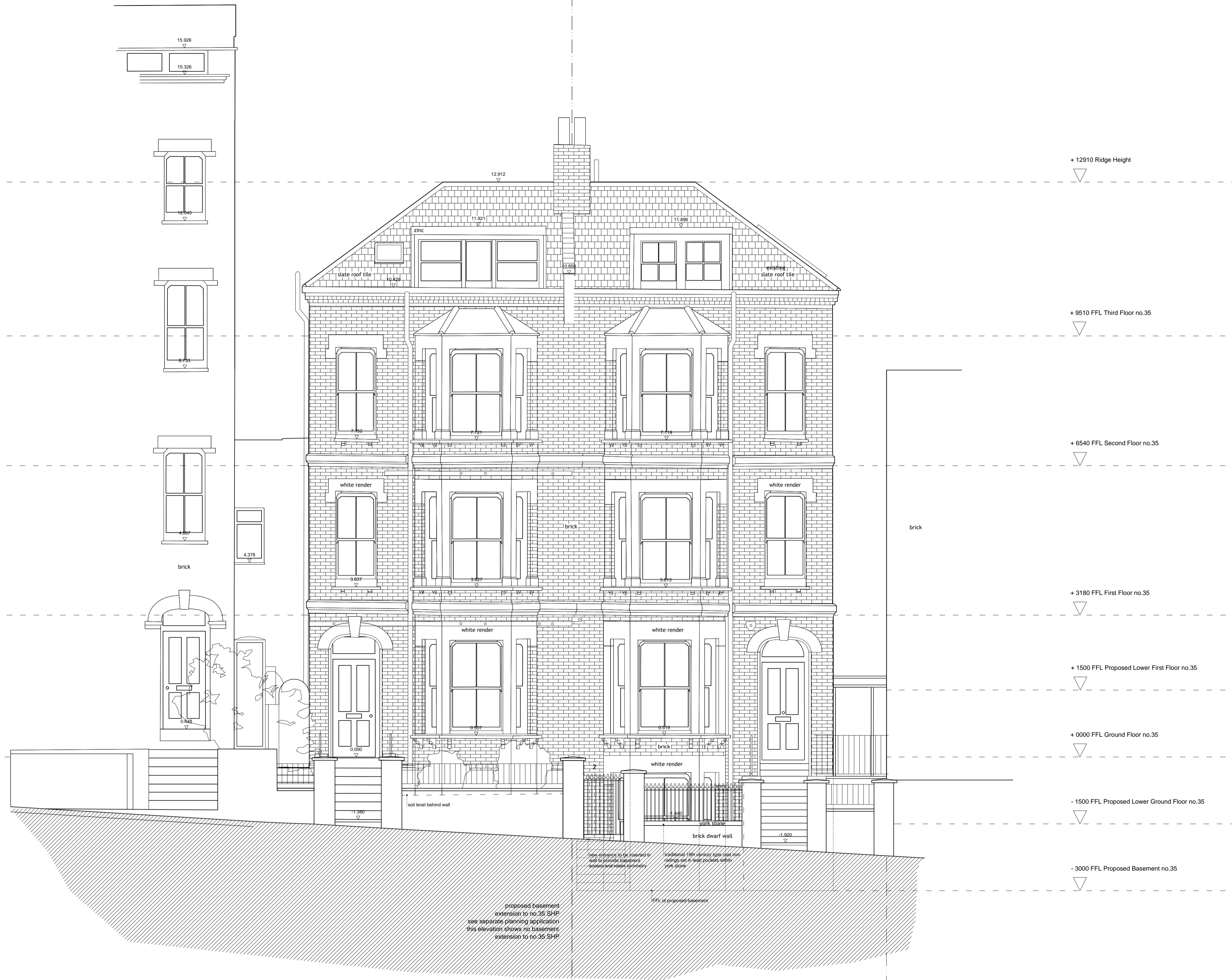
PROPOSED FRONT ELEVATION SHOWING ONLY BASEMENT WORKS TO NO.33