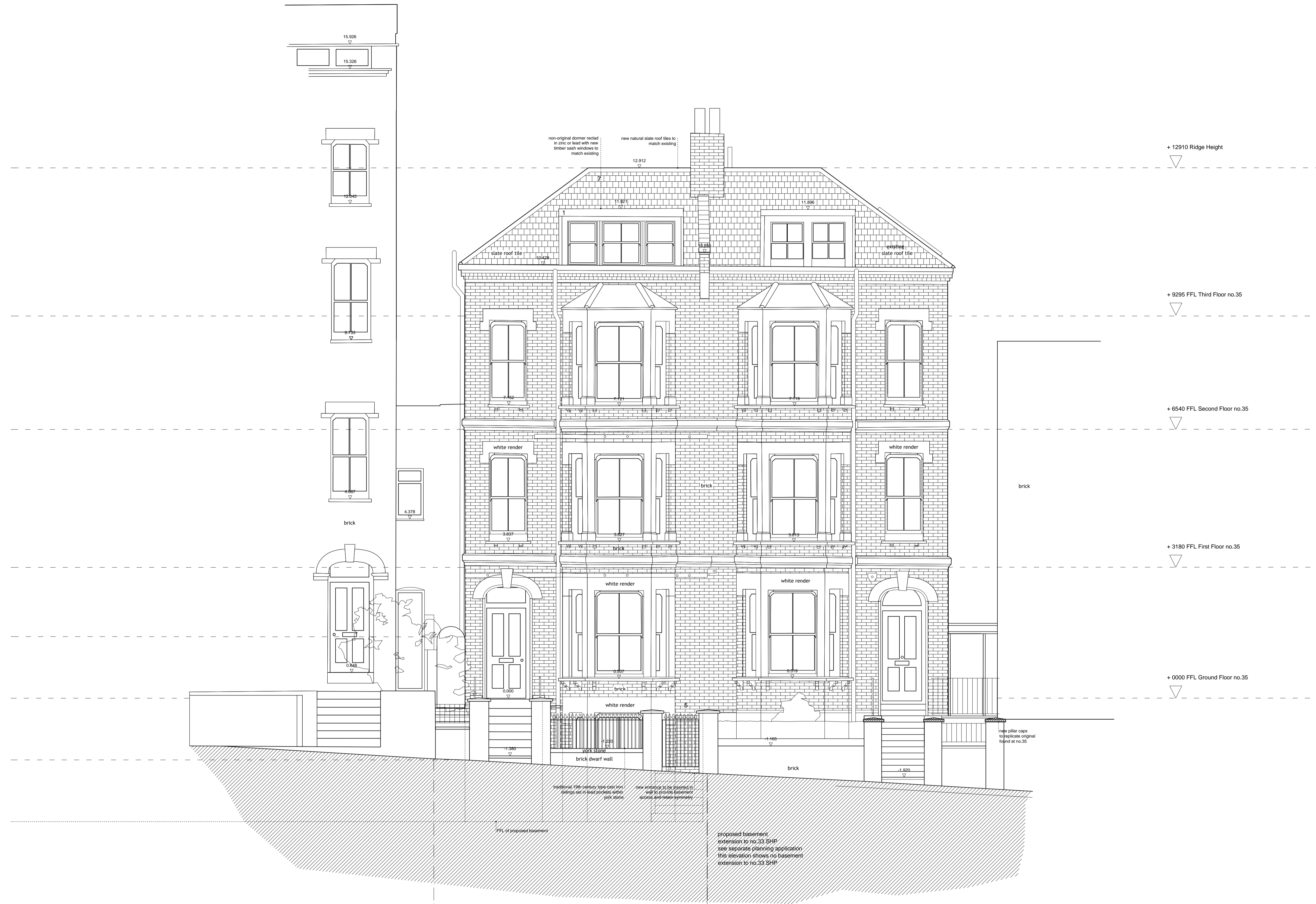
PROPOSED FRONT ELEVATION SHOWING ONLY BASEMENT WORKS TO NO.35