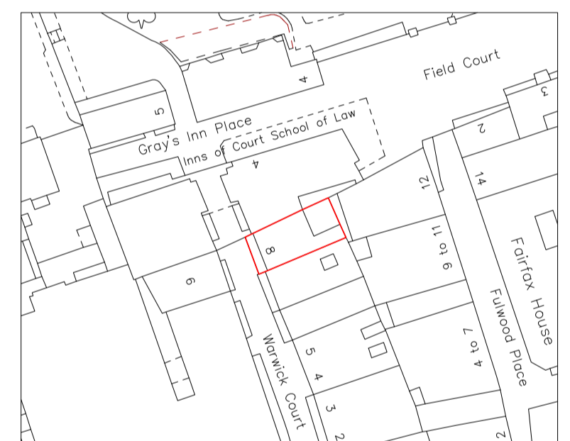
Key Plan 1:1000