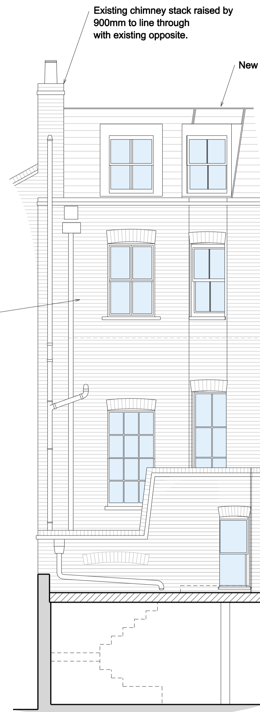
Part Rear Elevation