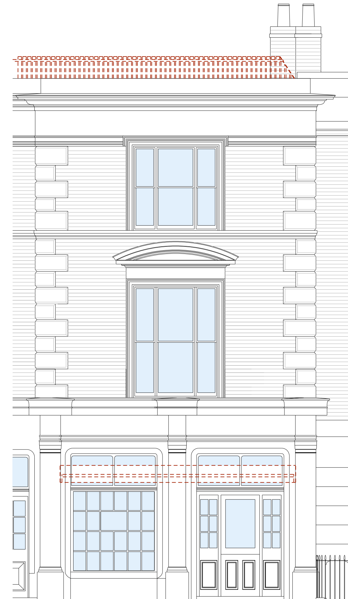
Part elevation (From Pakenham Street)