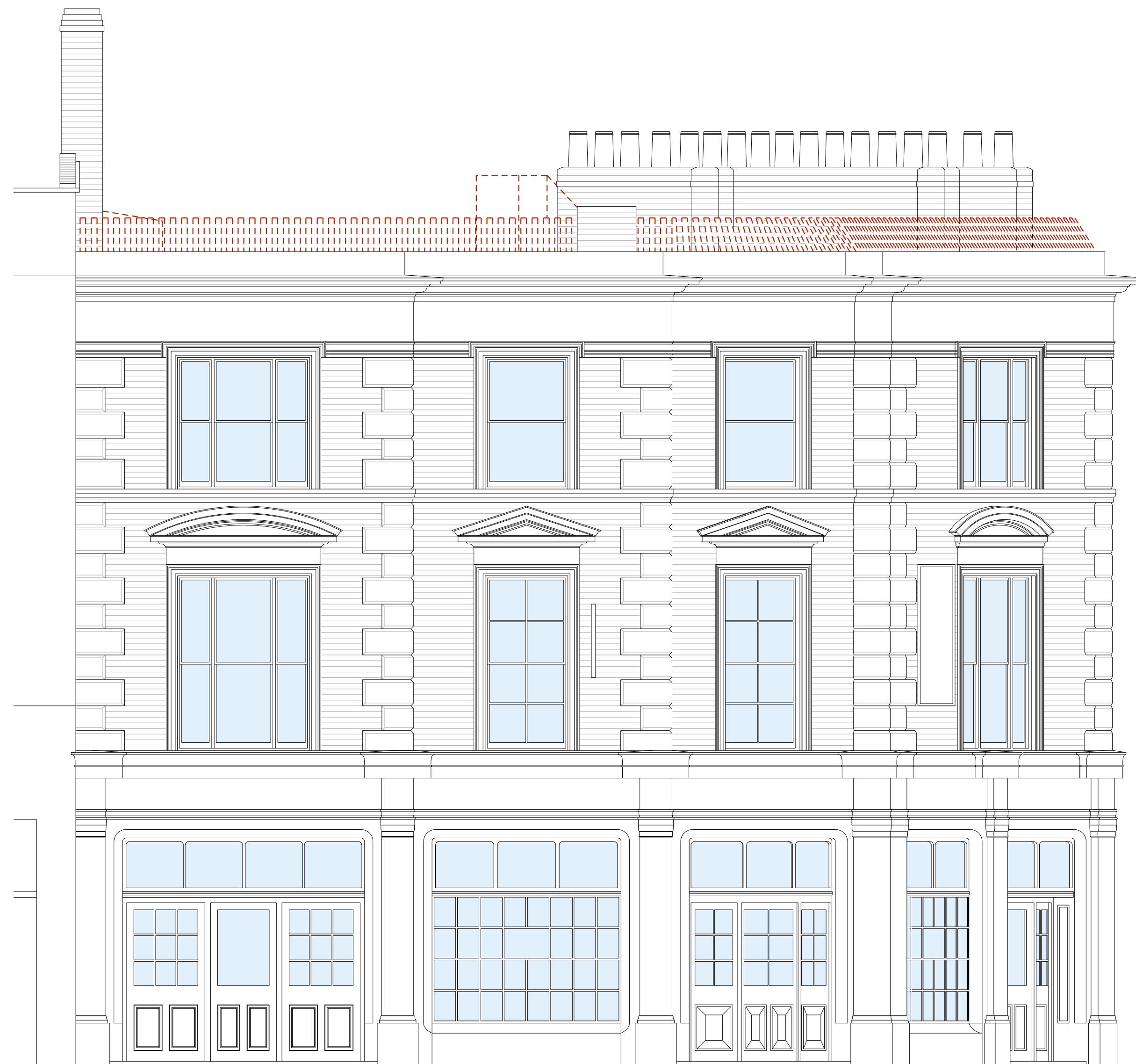
Front Elevation (From Calthorpe Street)