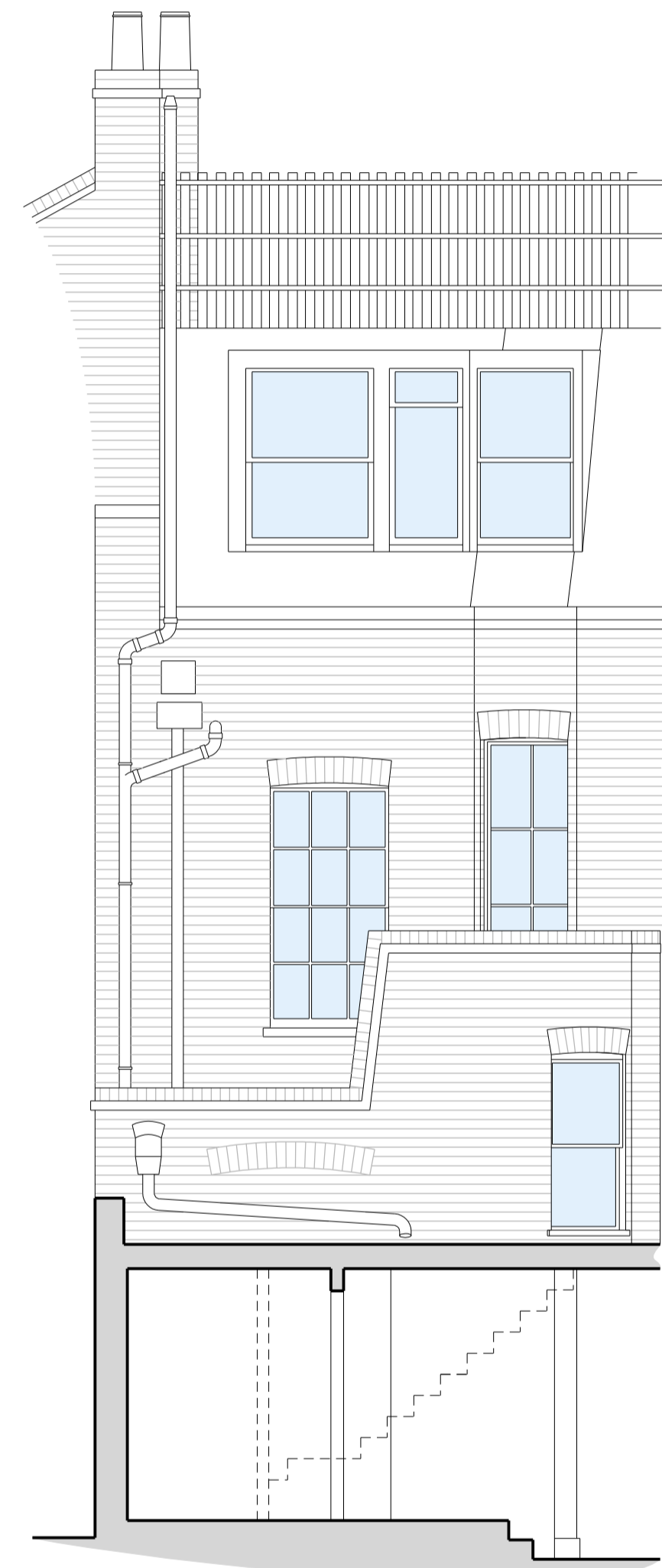
Part Rear Elevation