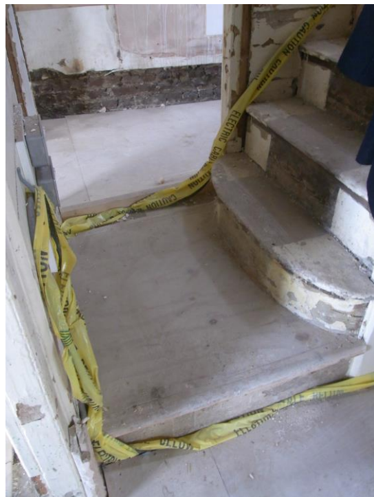
Staircase: First Floor