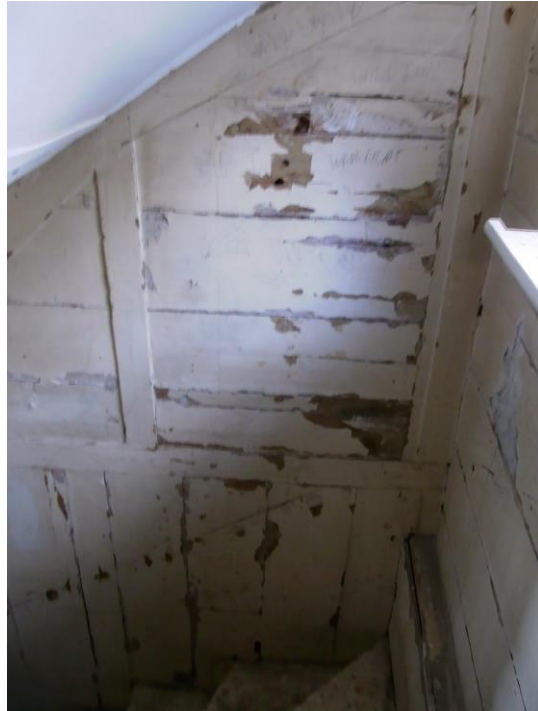
Staircase: Ground Floor to First Floor Landing