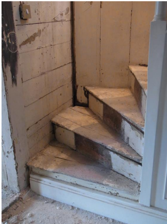
Stairwell: Ground Floor