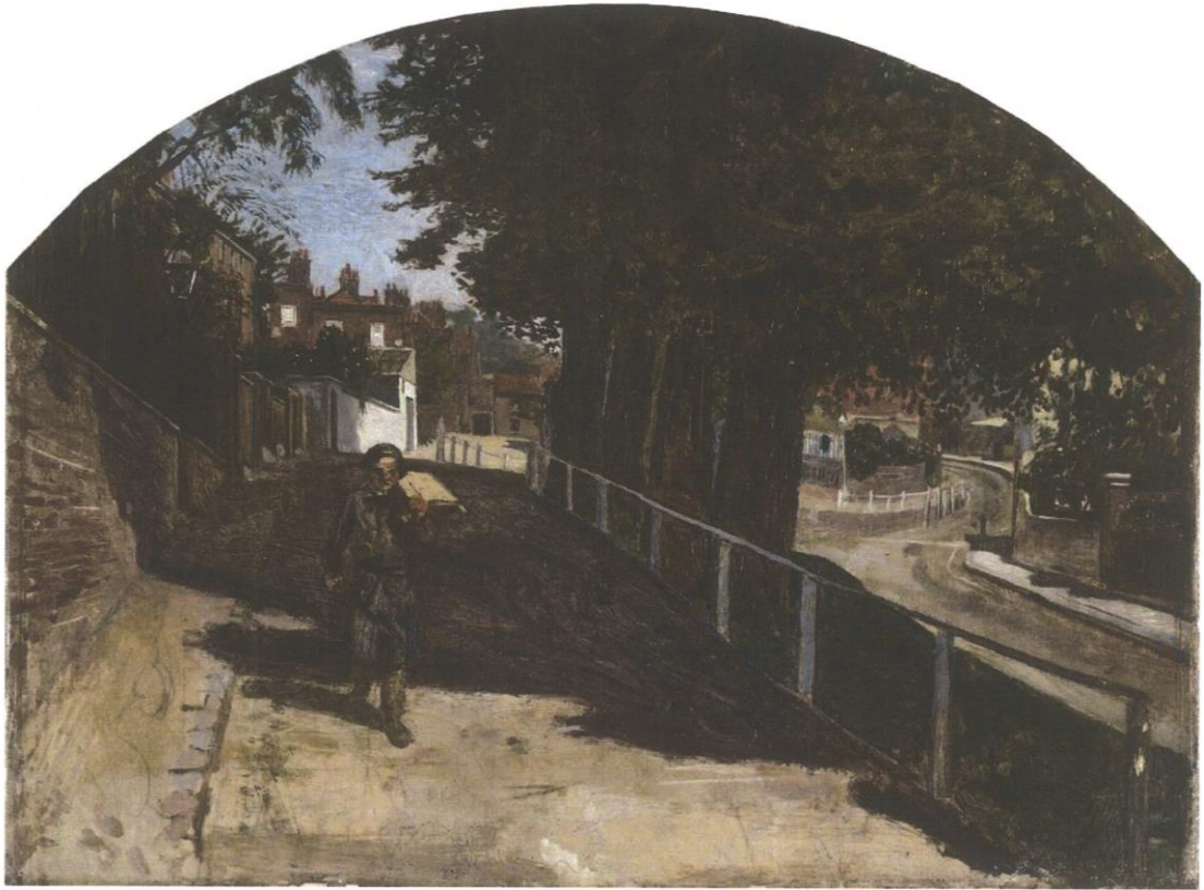
31 Painting by Ford Madox Brown, Study for above painting