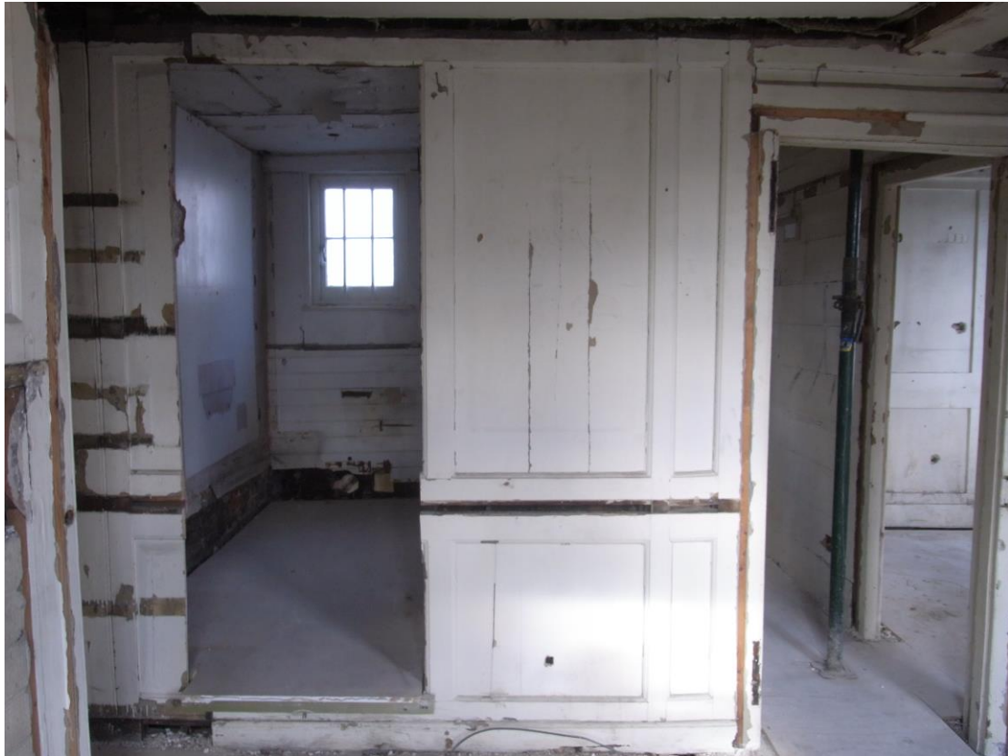
9 First Floor: view of dressing room & stairwell