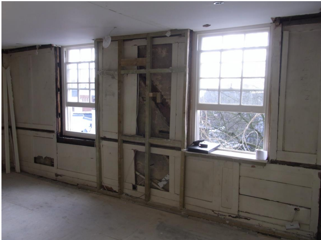
10 Second Floor: bedroom 1+2