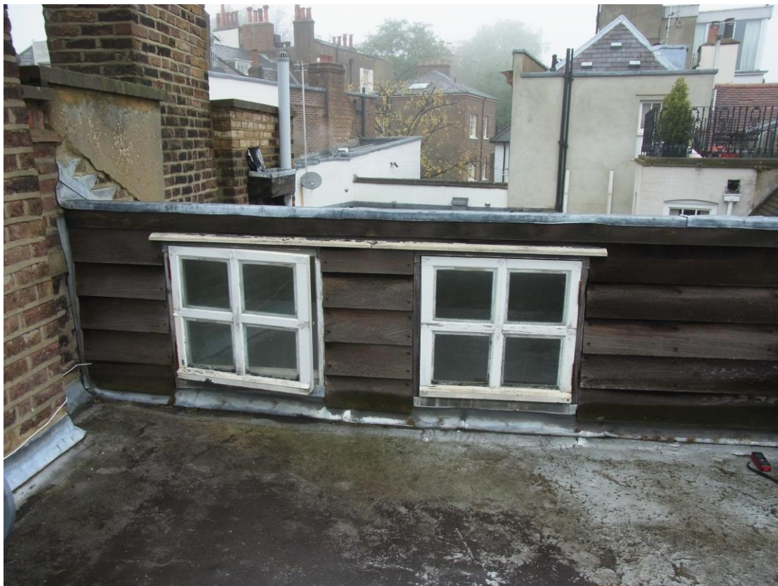
Windows overlooking flat roof