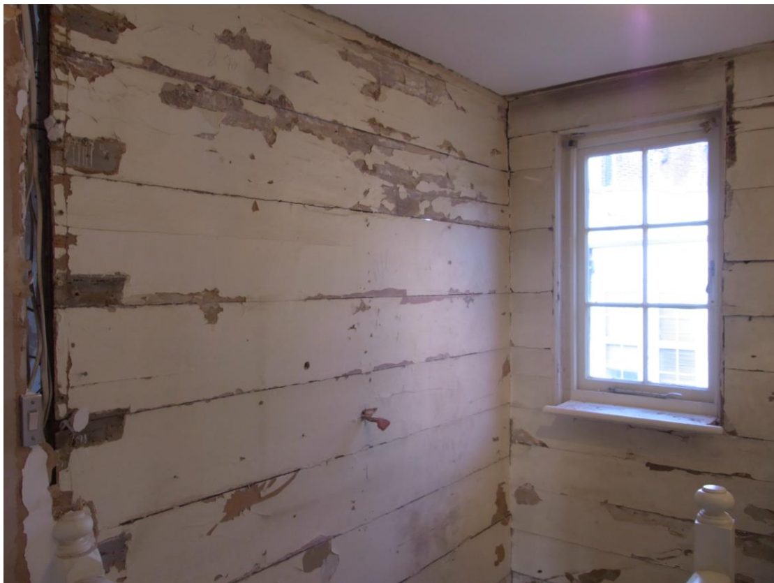
Staircase: First Floor to Second Floor Landing