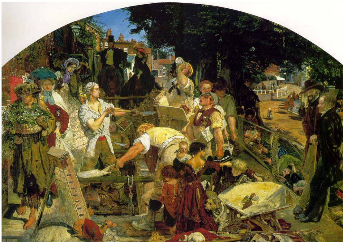
30 Painting by Ford Madox Brown, Street scene