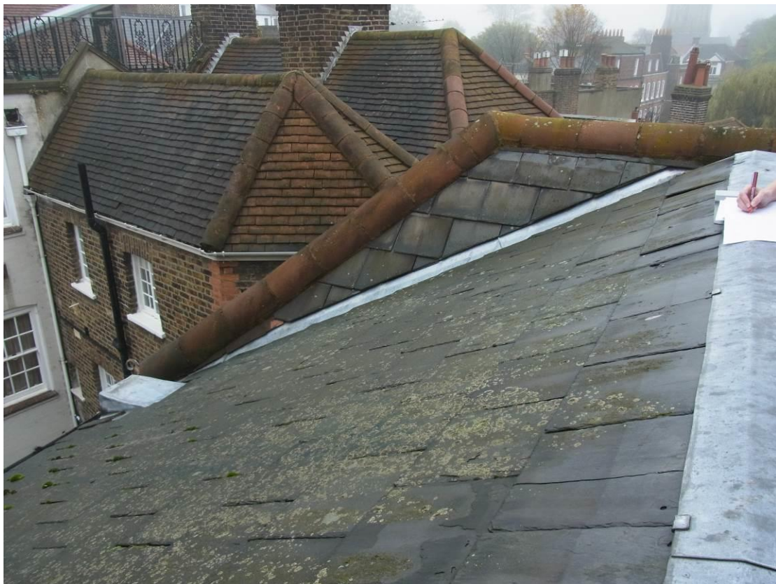
Rear Pitched Roof