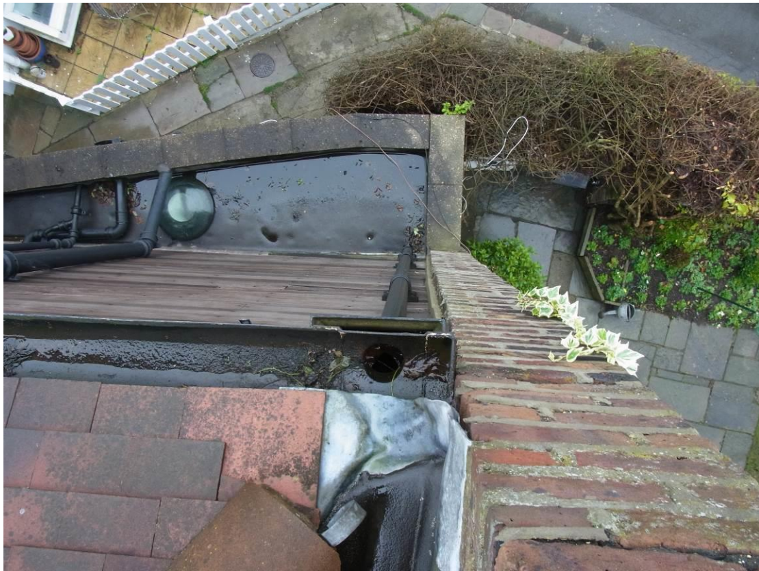
29 View of side extension roof and small roof light