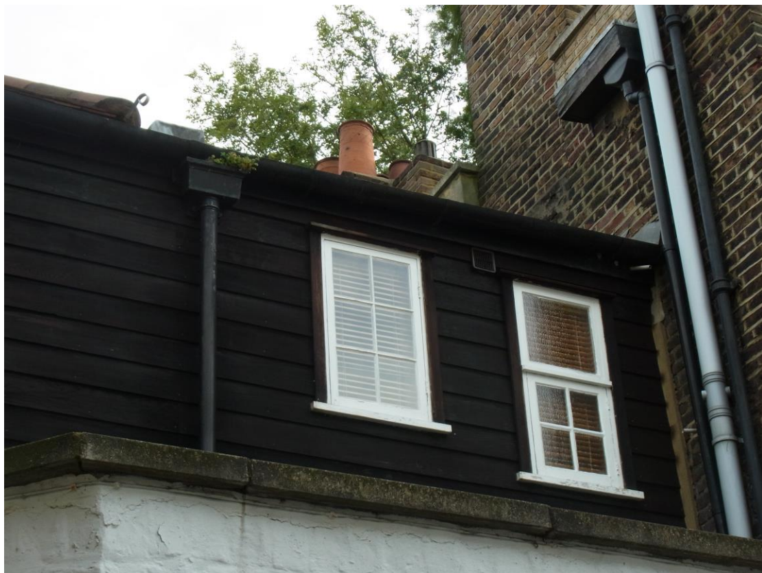
The Mount, Side elevation