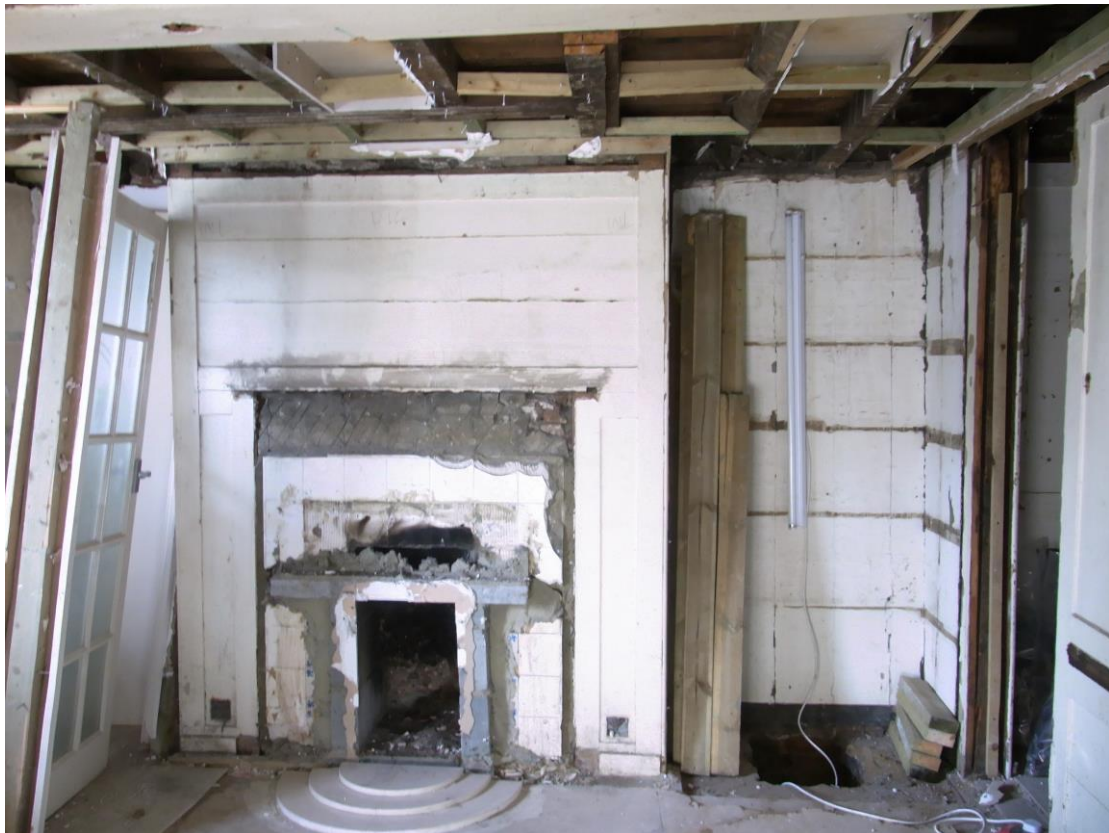
Ground floor: Living room