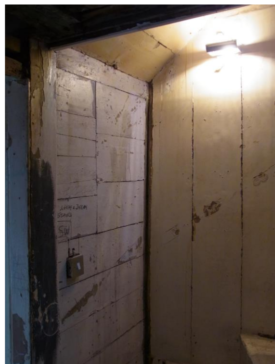
Stairwell: Ground Floor