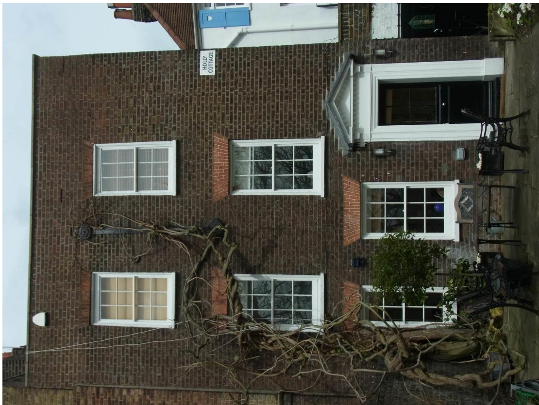
The Mount, street elevation