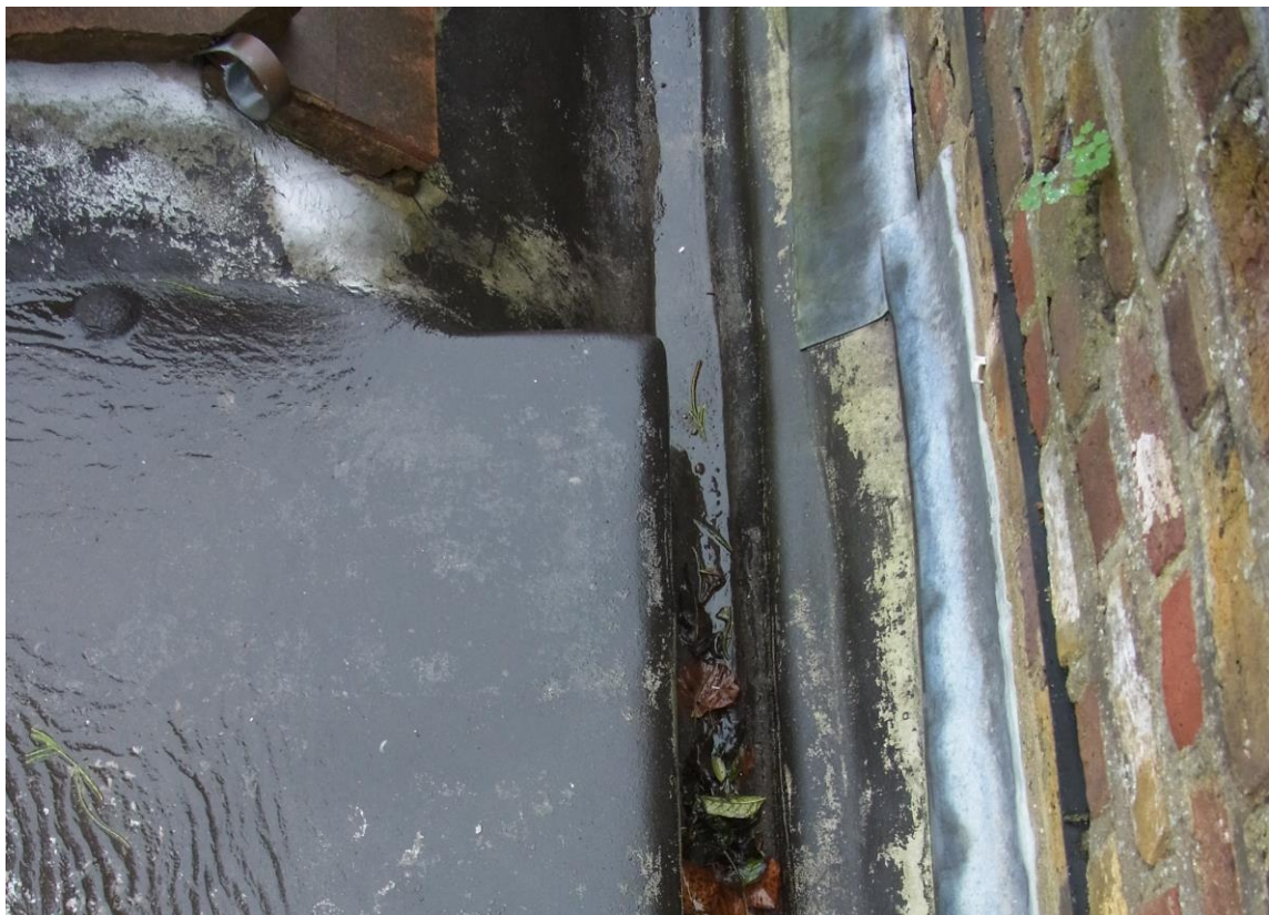
Flat section of roof