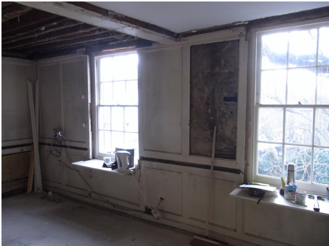
Ground floor: Living room Internal panelling and view of panelling from hall