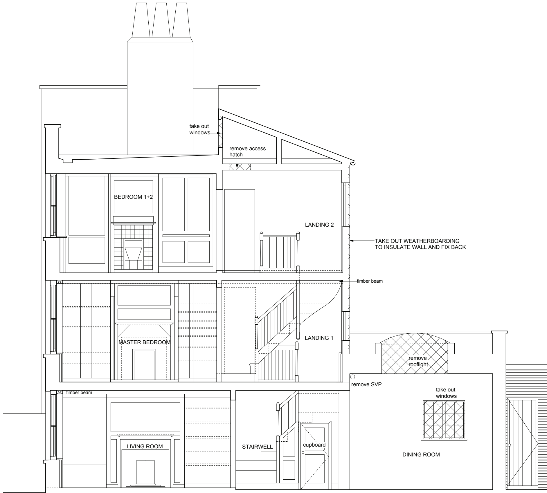
01 Existing section - A-A 03 1:25@A1, 1:50@A3