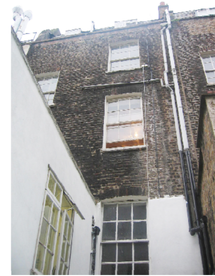
03 SOUTH ELEVATION PL100