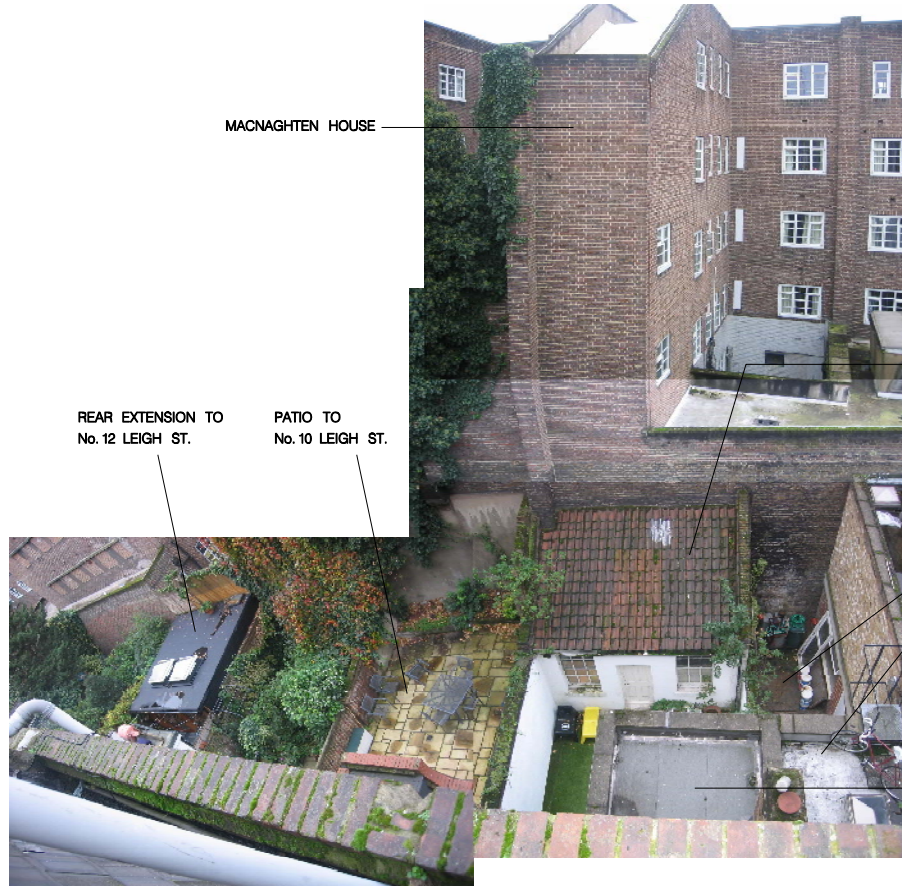
04 VIEW FROM ROOF LEVEL TOWARDS THE SOUTH PL100