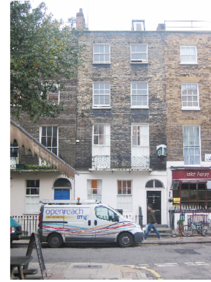
02 NORTH ELEVATION LEIGH STREET PL100