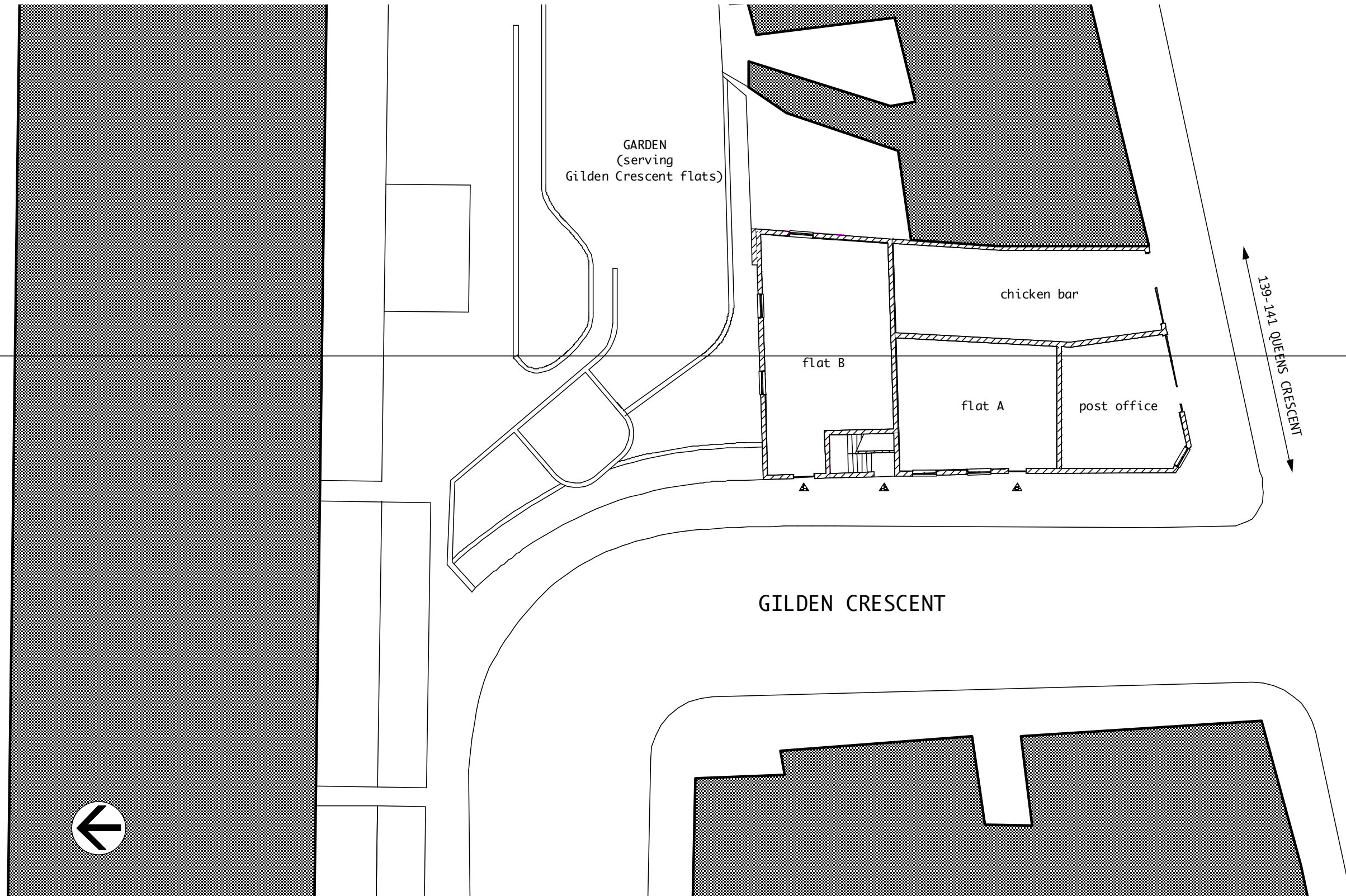
1 existing ground plan with surroundings Scale: 1:200