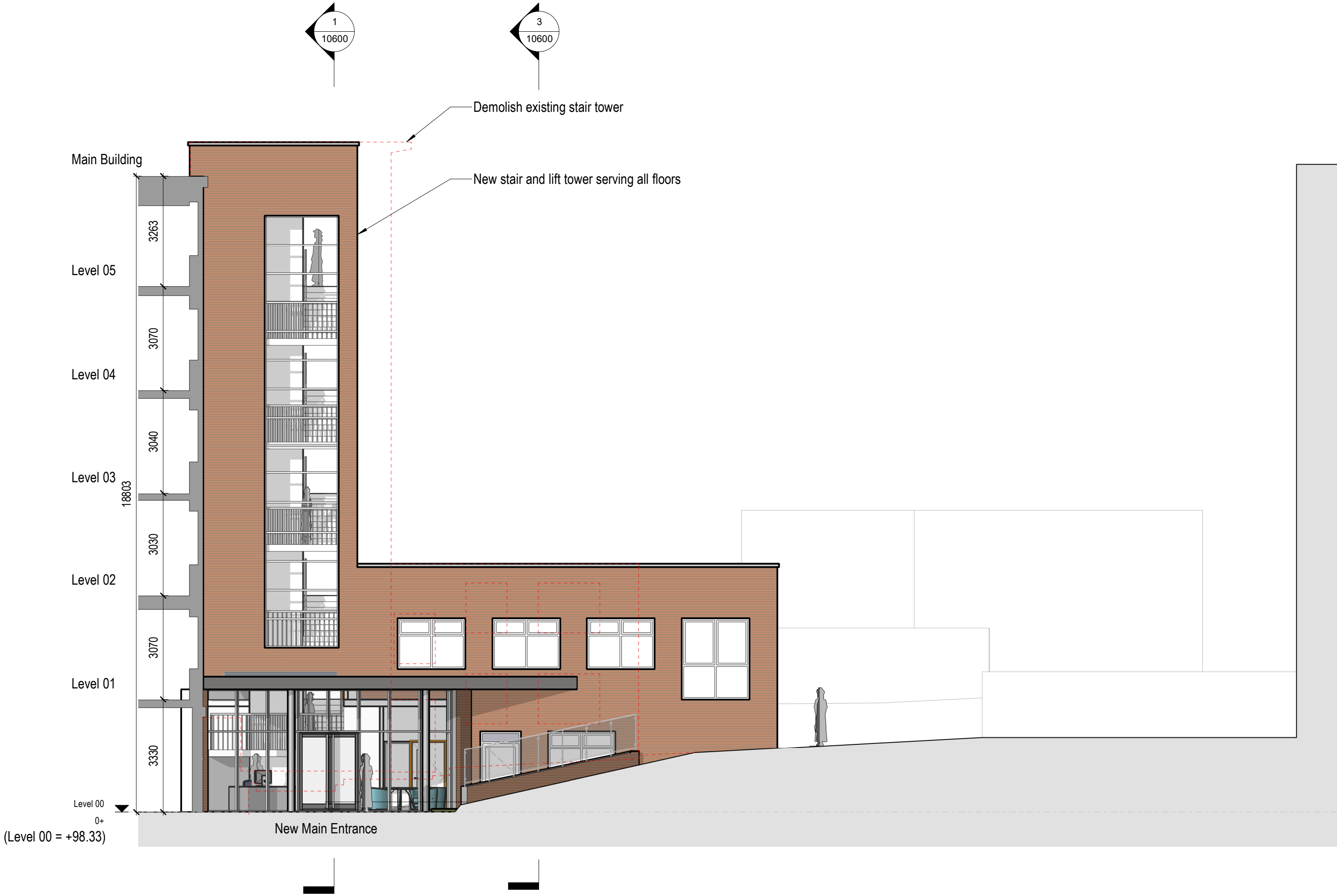
2 | Elevation 2 - Proposed