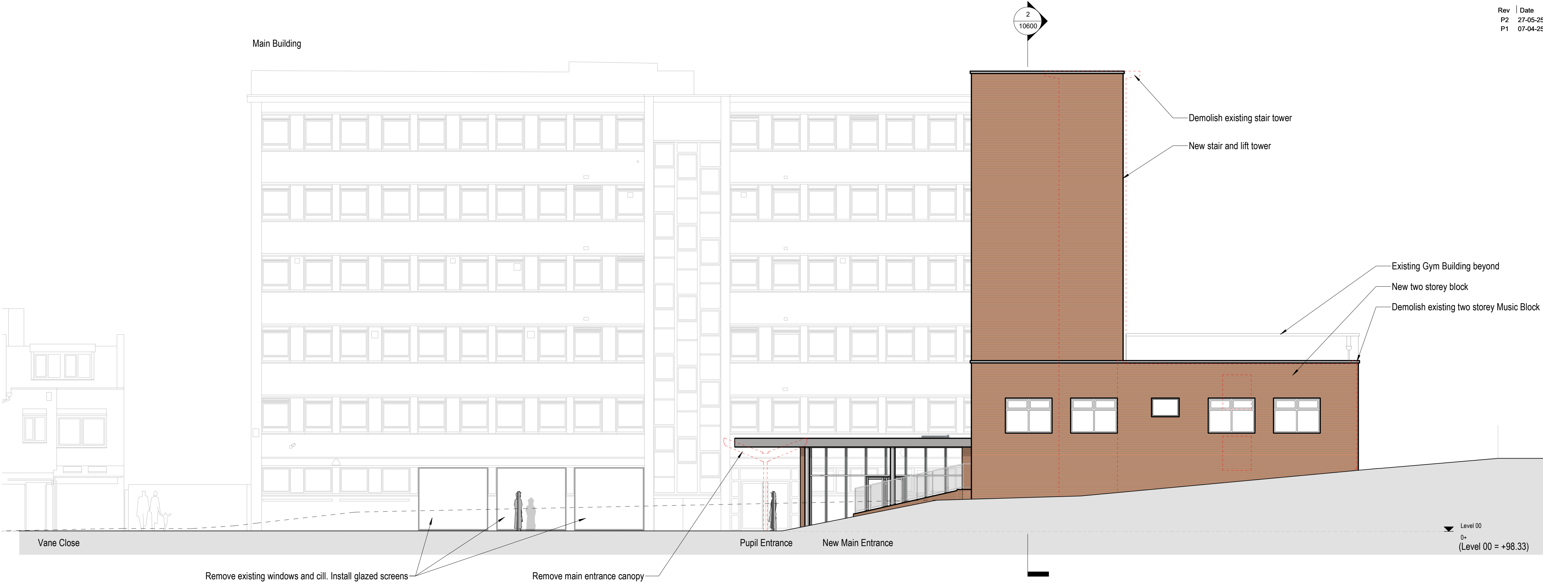
1 | Elevation 1 - Proposed