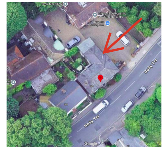
KEY: side elevation