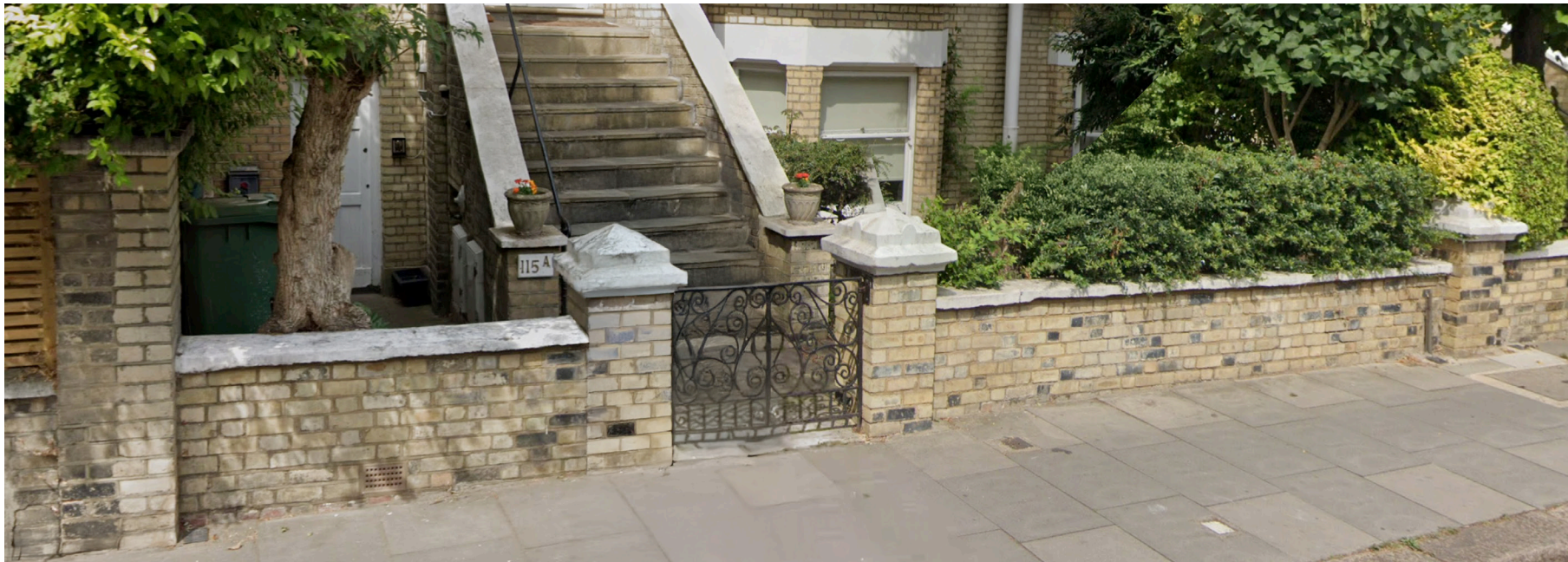
Photograph of Existing