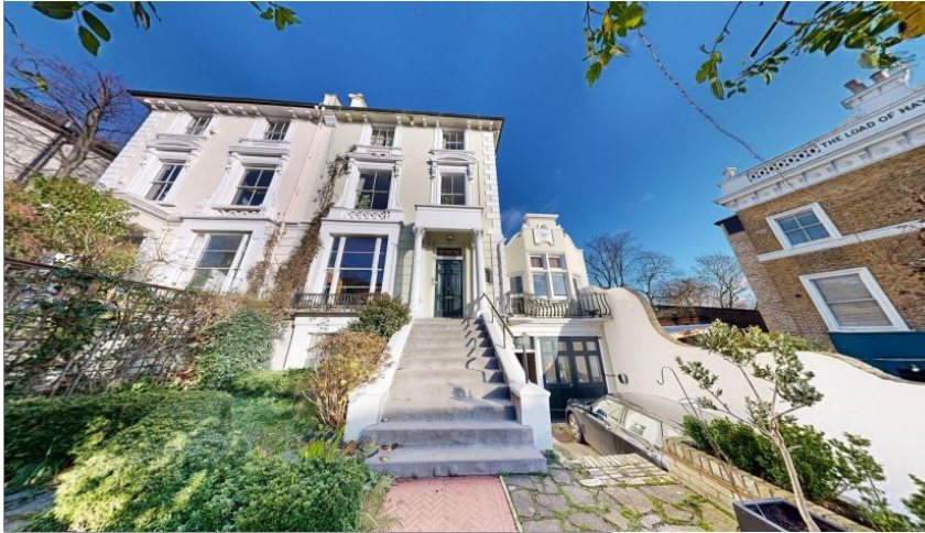
Existing Front facade