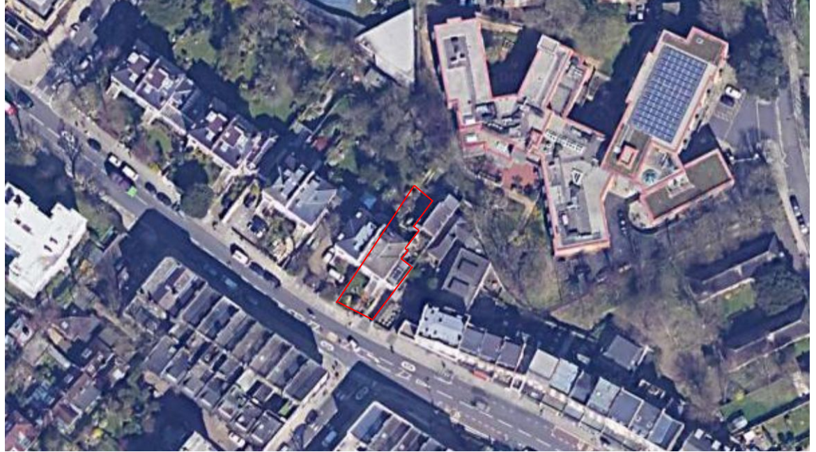
Existing Site View

It is on the North side of Haverstock Hill. The existing site is irregular and benefits from a decent-sized rear garden laid to grass.