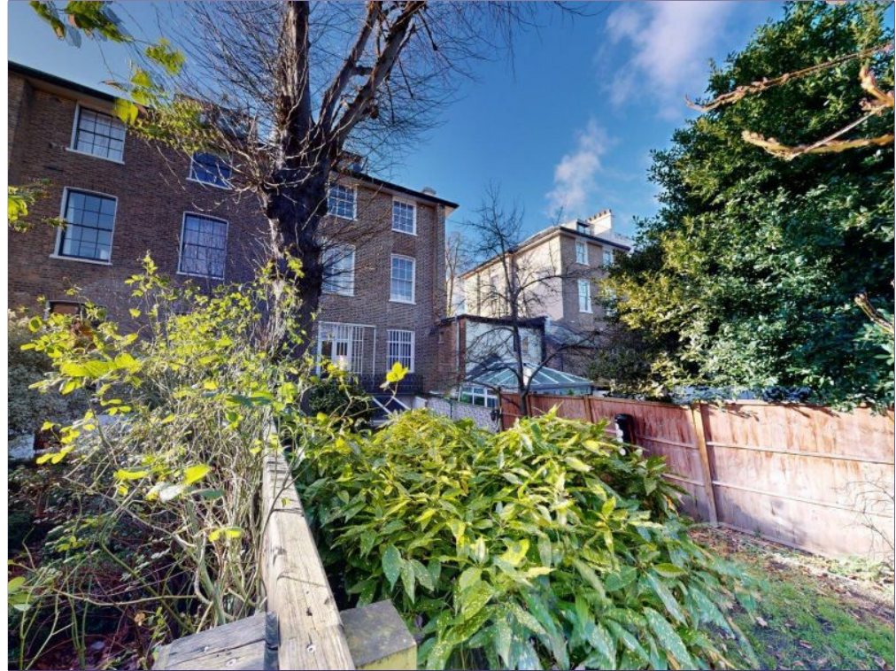
View of Neighbouring Property