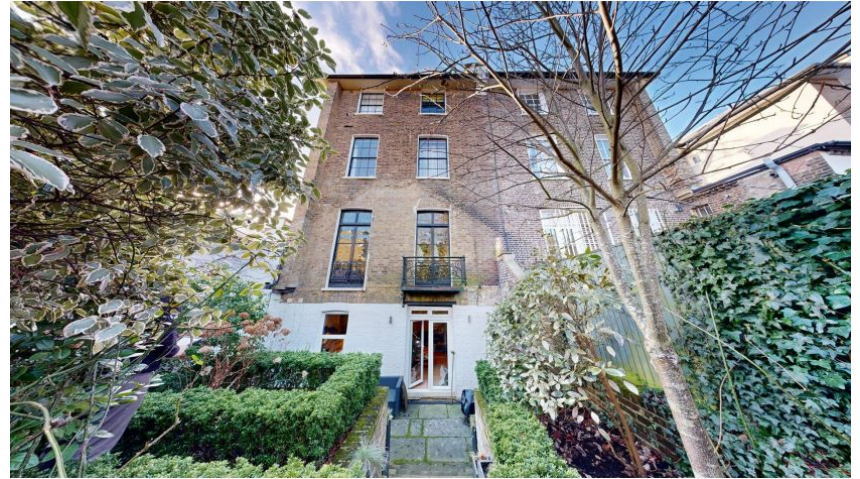
Existing Rear facade