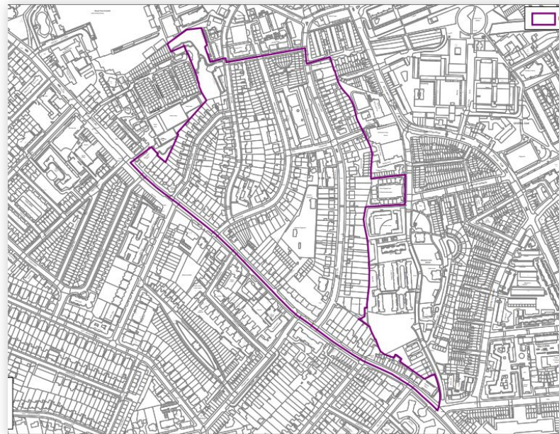
Parkhill and Upper Park Conservation Area

The surrounding area is filled with stuccoed semi-detached villas, with number 96 having a coach house that features a monogram dated 1890 on the elevation. Along the busy and wide road there is a consistent pattern of front and rear gardens.