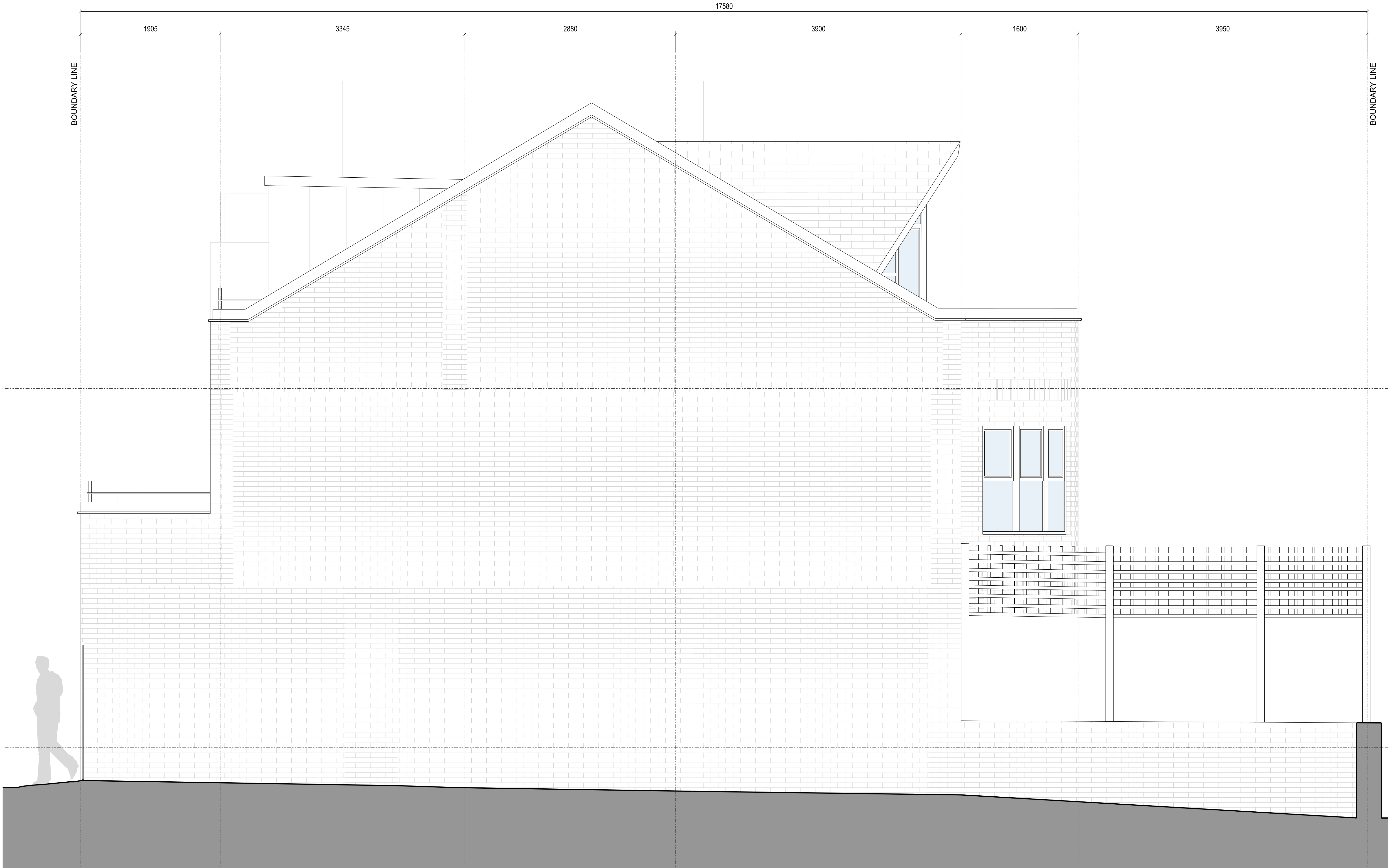
1 EXISTING SIDE ELEVATION