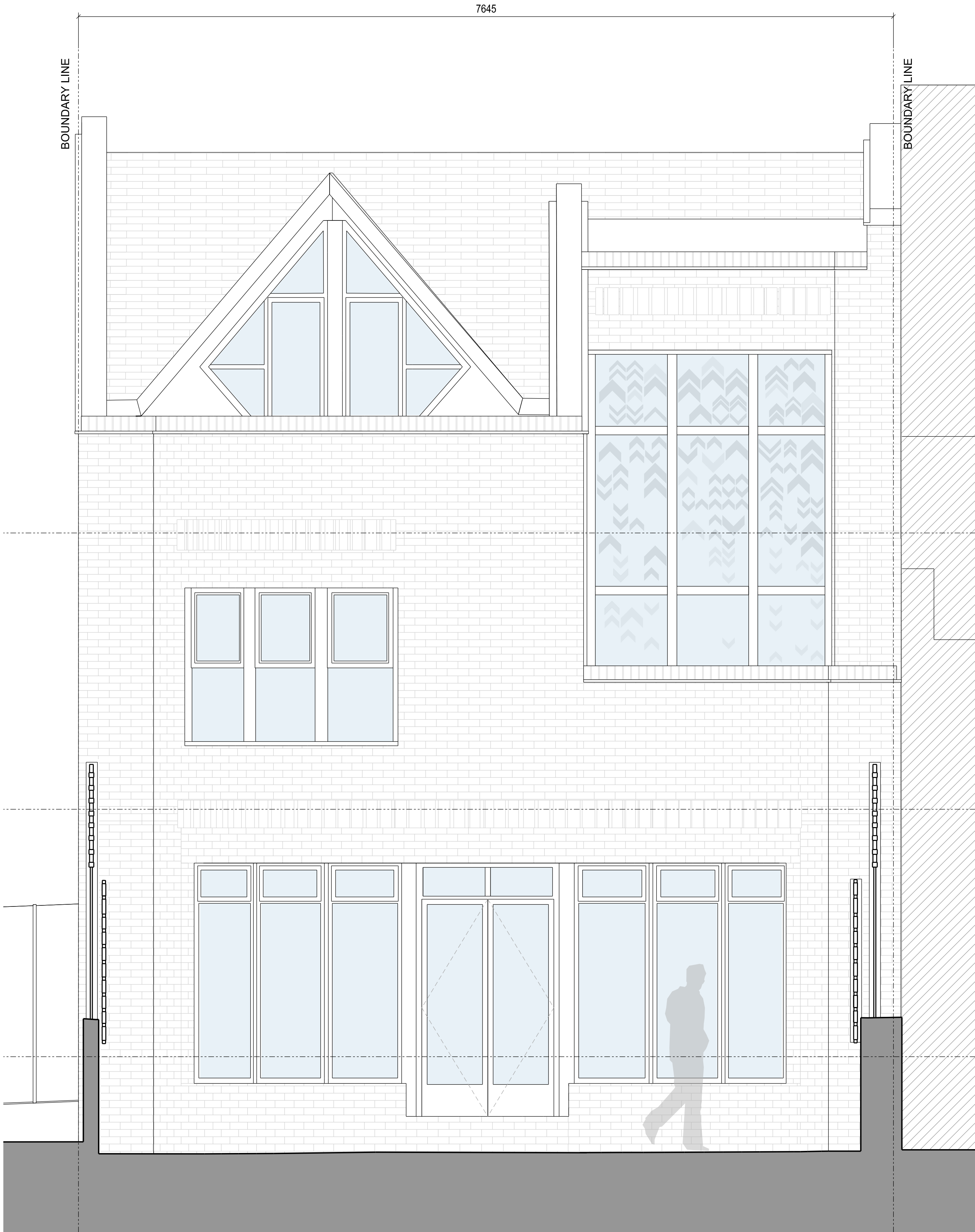
1 EXISTING REAR ELEVATION Scale 1:50 at A3 / 1:25 at A1