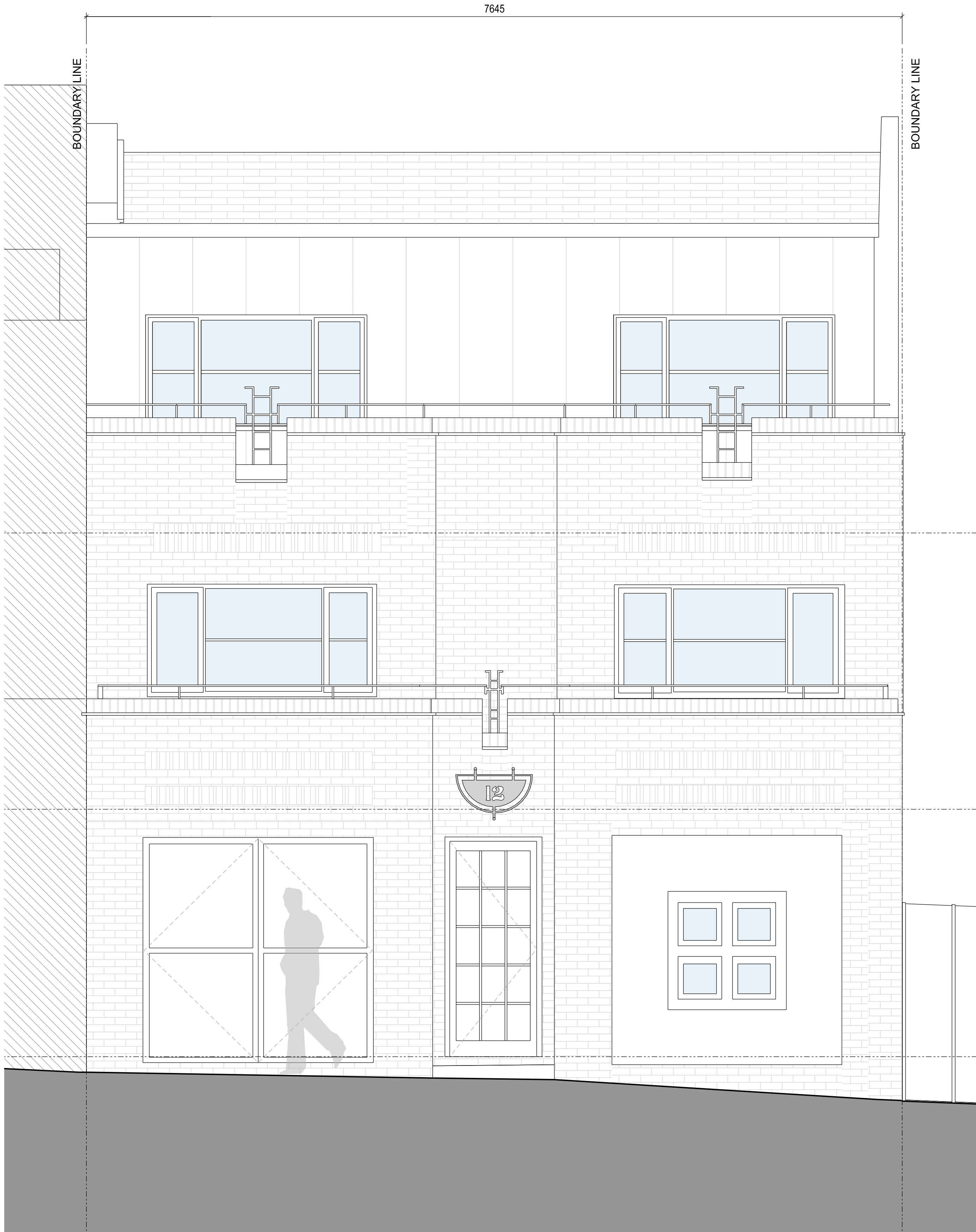
1 EXISTING FRONT ELEVATION Scale 1:50 at A3 / 1:25 at A1