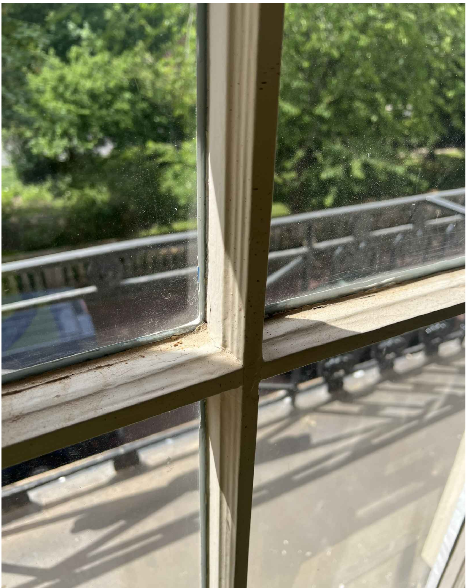
Existing glazing bar to interior of first floor windows on the front facade