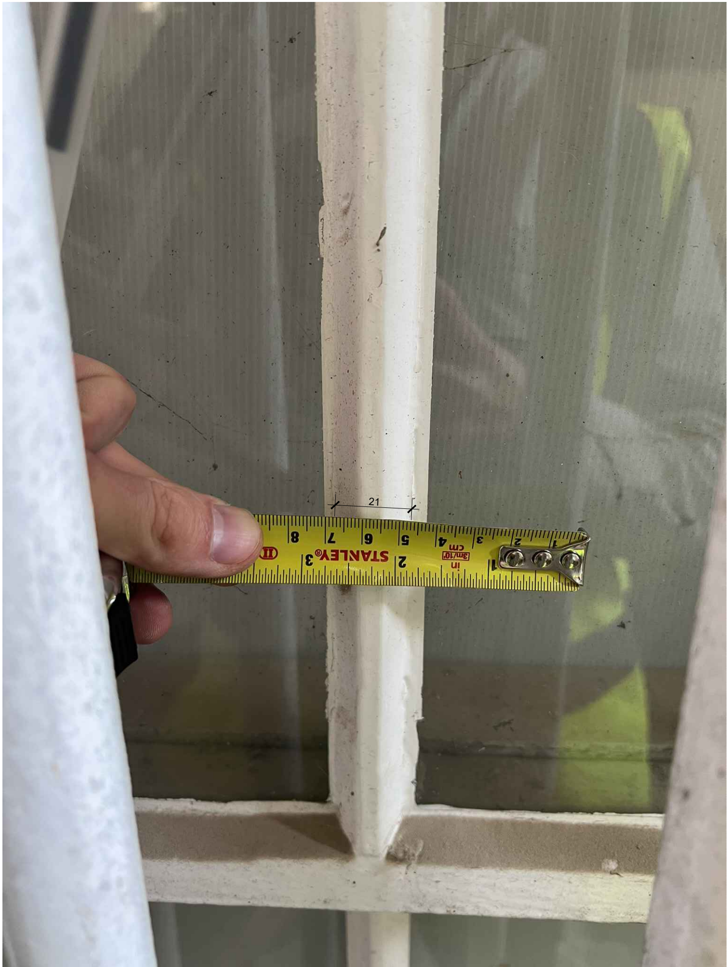
Existing glazing bar to exterior of lower ground floor windows on the front facade