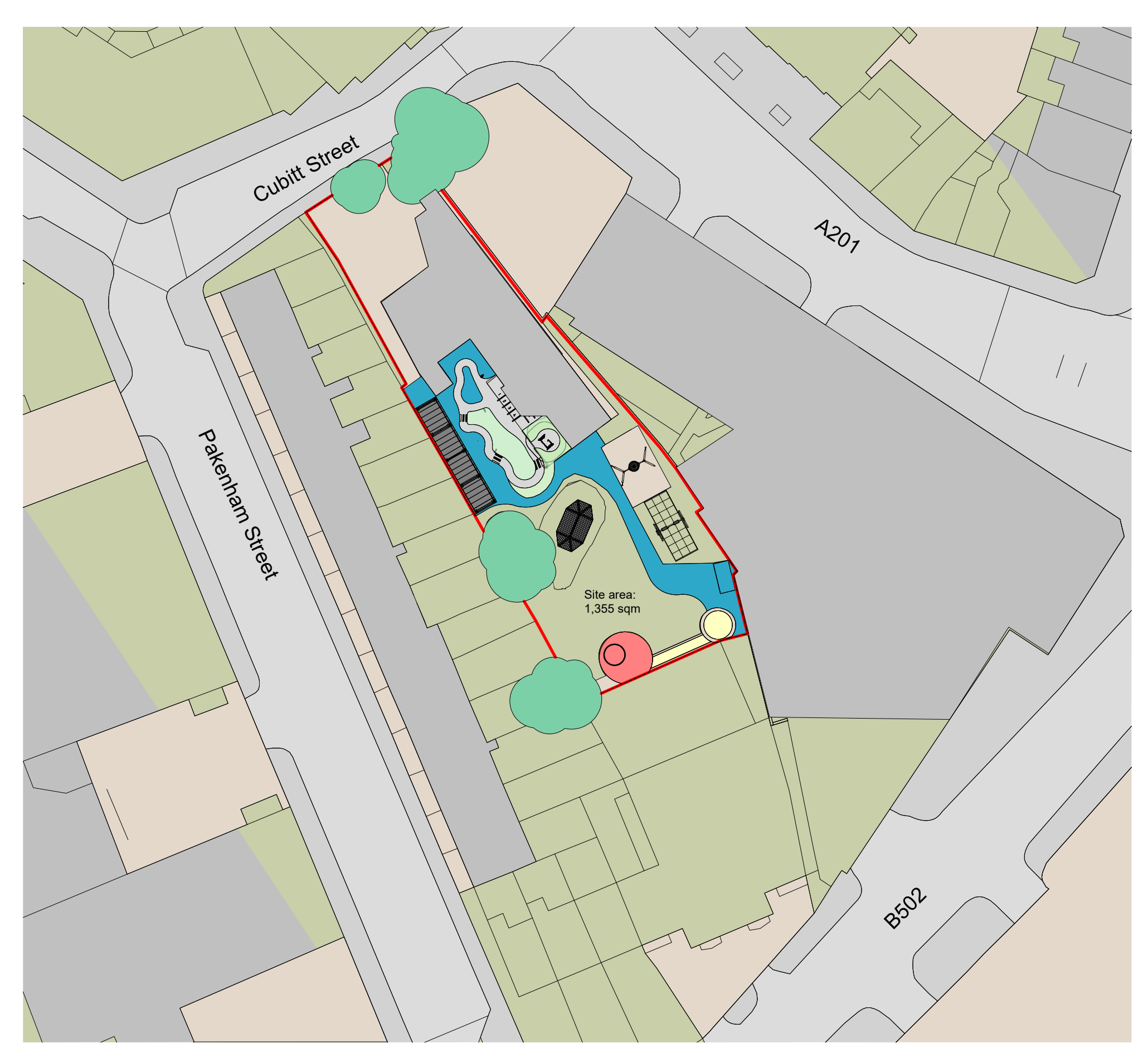
Site Plan, as proposed 1:500

The use of this data/drawing by the recipient acts as an agreement of the following statements. All drawings are based upon site information supplied by third parties/sub contractors and as such their accuracy cannot be guaranteed. All features are approximate and subject to clarification by a detailed topographical survey, statutory service enquiries and confirmation of the legal boundaries. Check all dimensions on site. Drawings printed on mediums such as paper are not to be relied upon for scaling purposes as dimensional inaccuracy occur resulting from changes in environmental conditions. Use figured dimensions in all cases. All dimensions to be in metric standards unless stated otherwise.