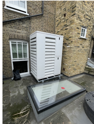
V2 - View of Existing plant