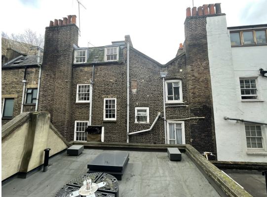
V1 - View towards rear neighbouring elevations