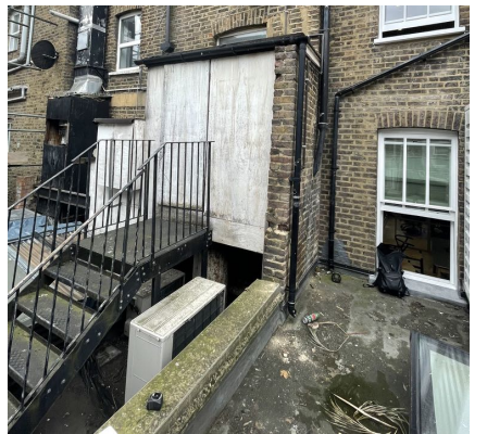
V4 - View of existing flat roof finish