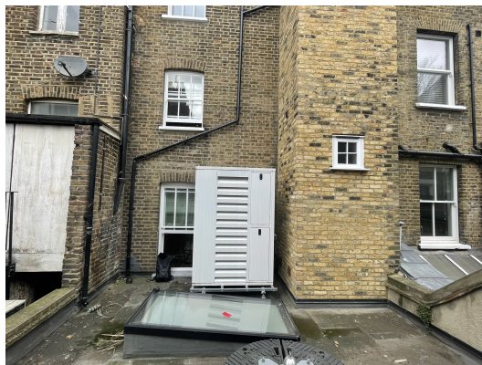
V3 - View to rear elevation of 27 Goodges Street.