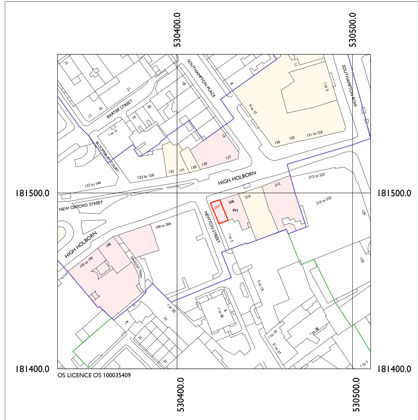
SITE LOCATION PLAN 1 : 1250