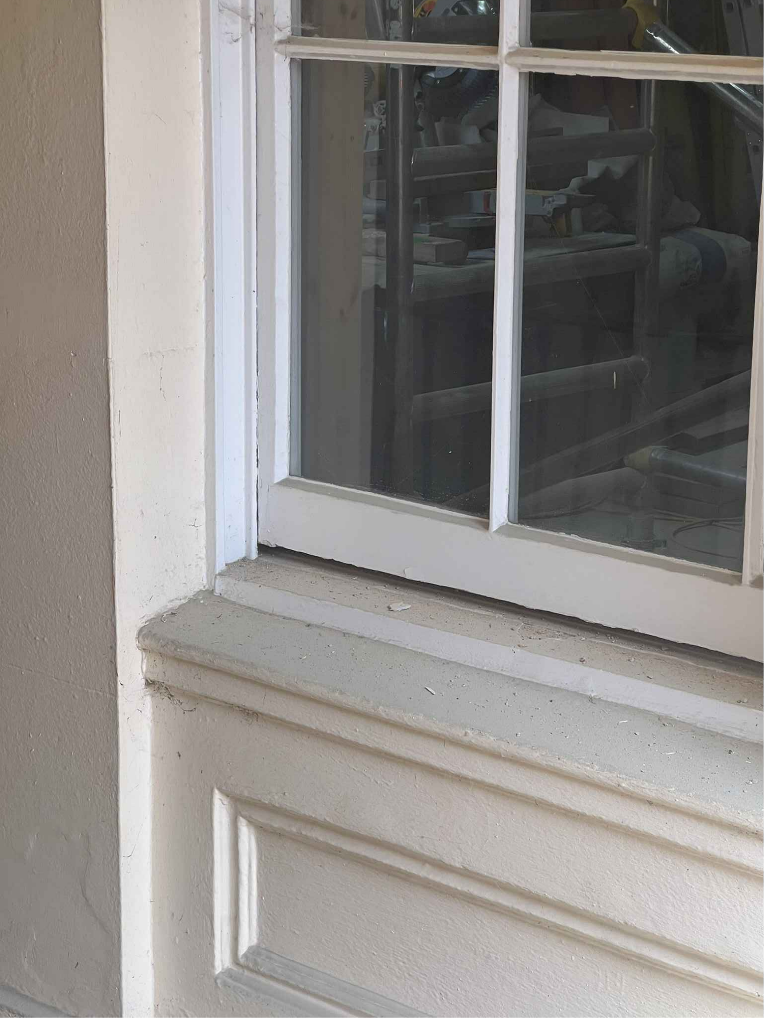
Existing ground floor front window