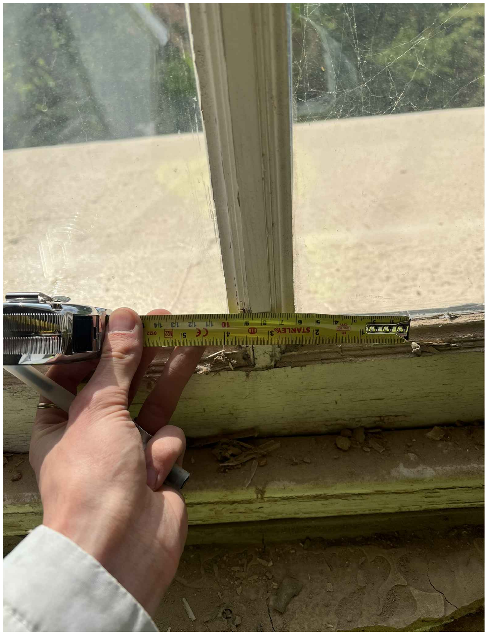
Existing second floor front window