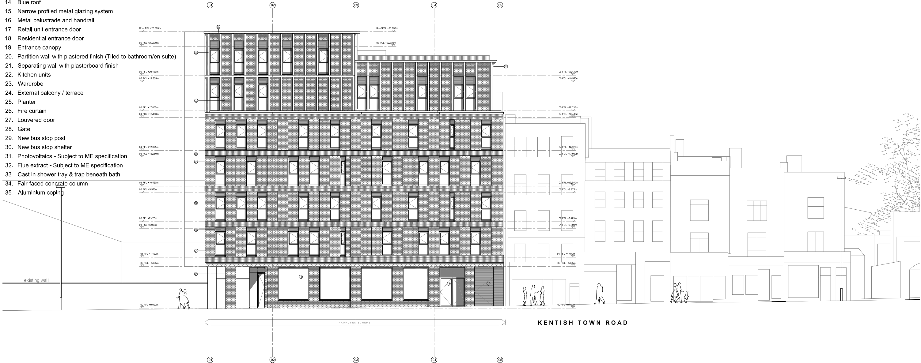
01 PROPOSED EAST ELEVATION A200 Scale 1:200 @ A3 / 1:100 @ A1