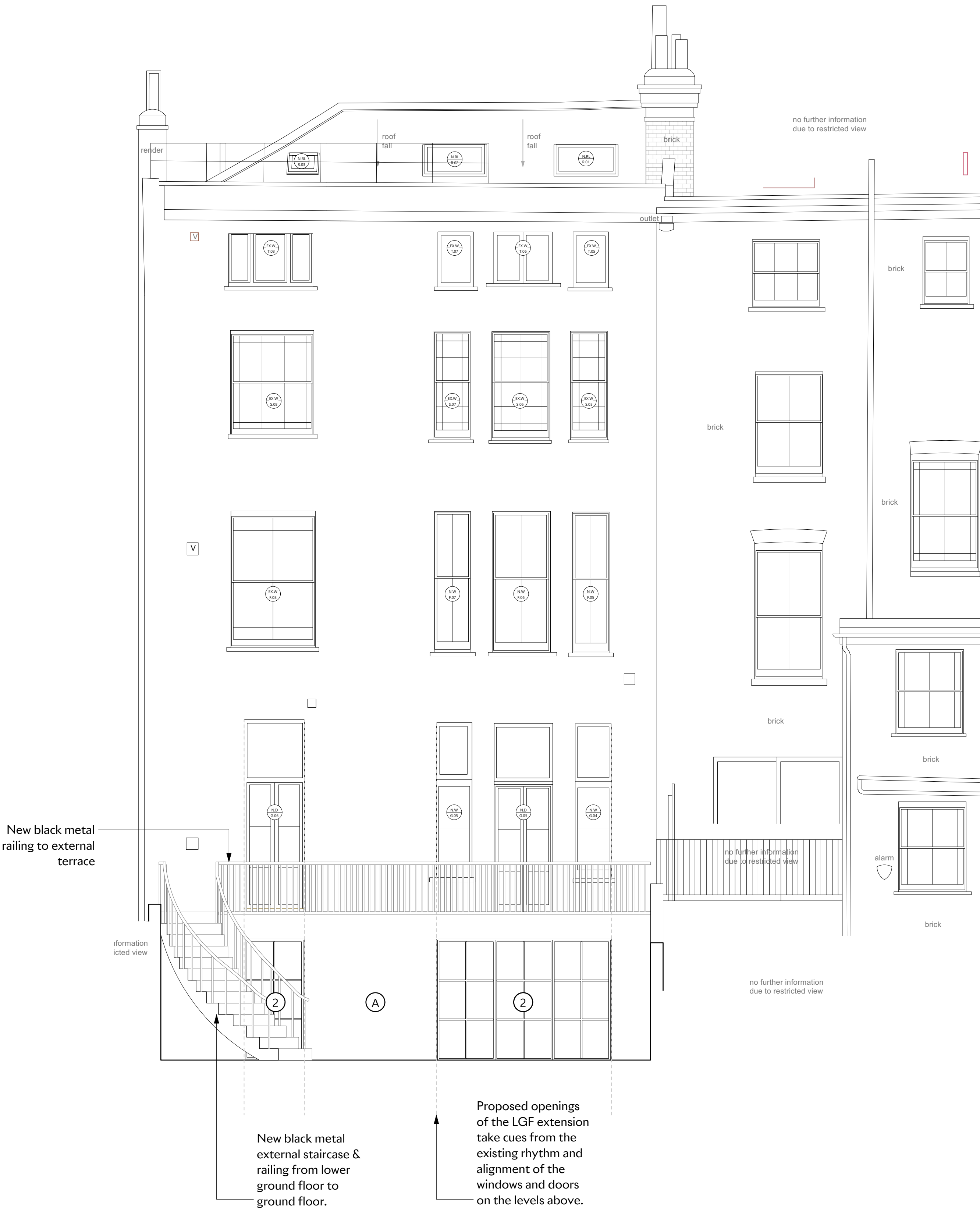
1 Proposed South East (Rear) Elevation Scale: 1:50