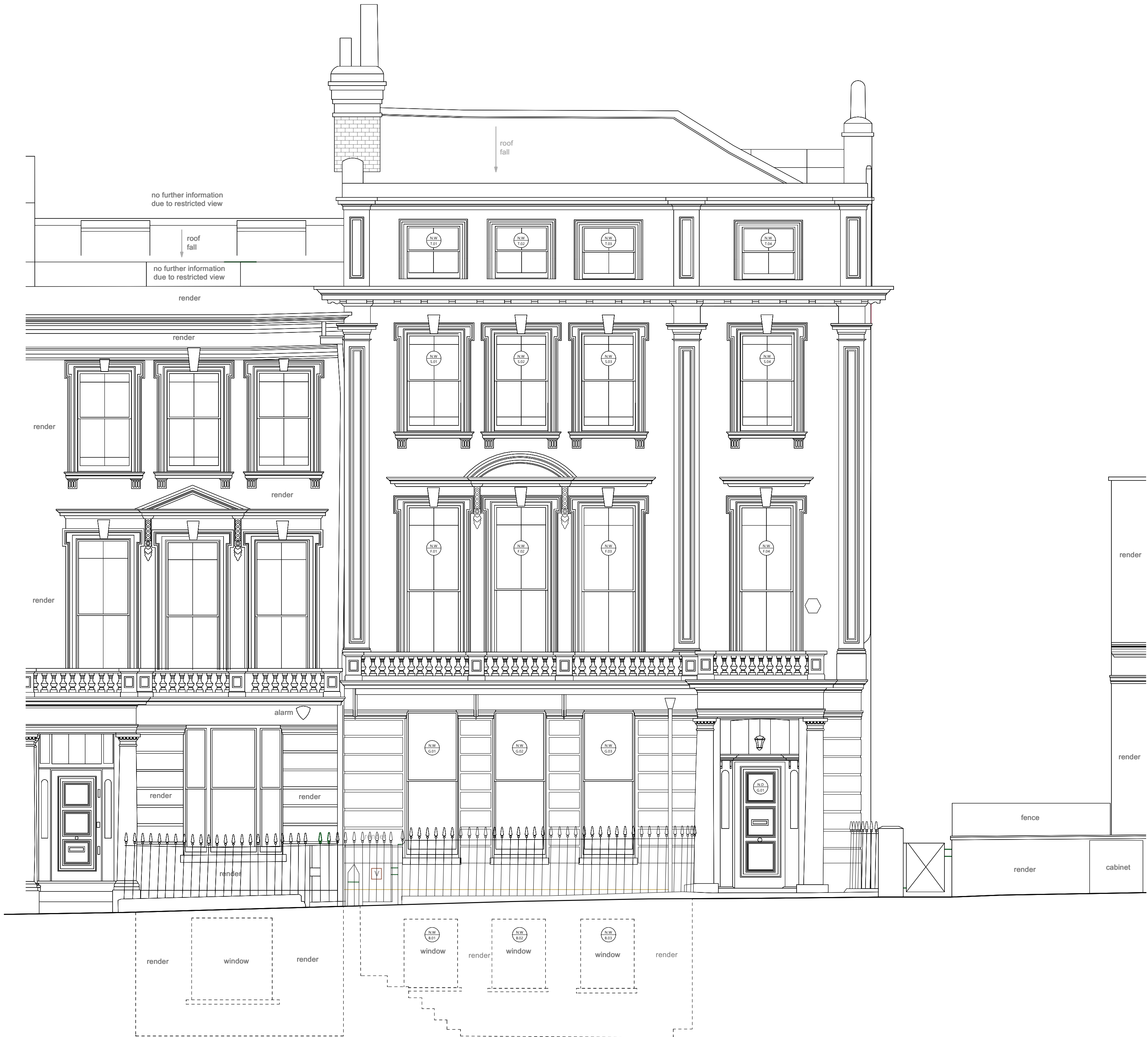
1 Proposed North West (Front) Elevation - No Alterations