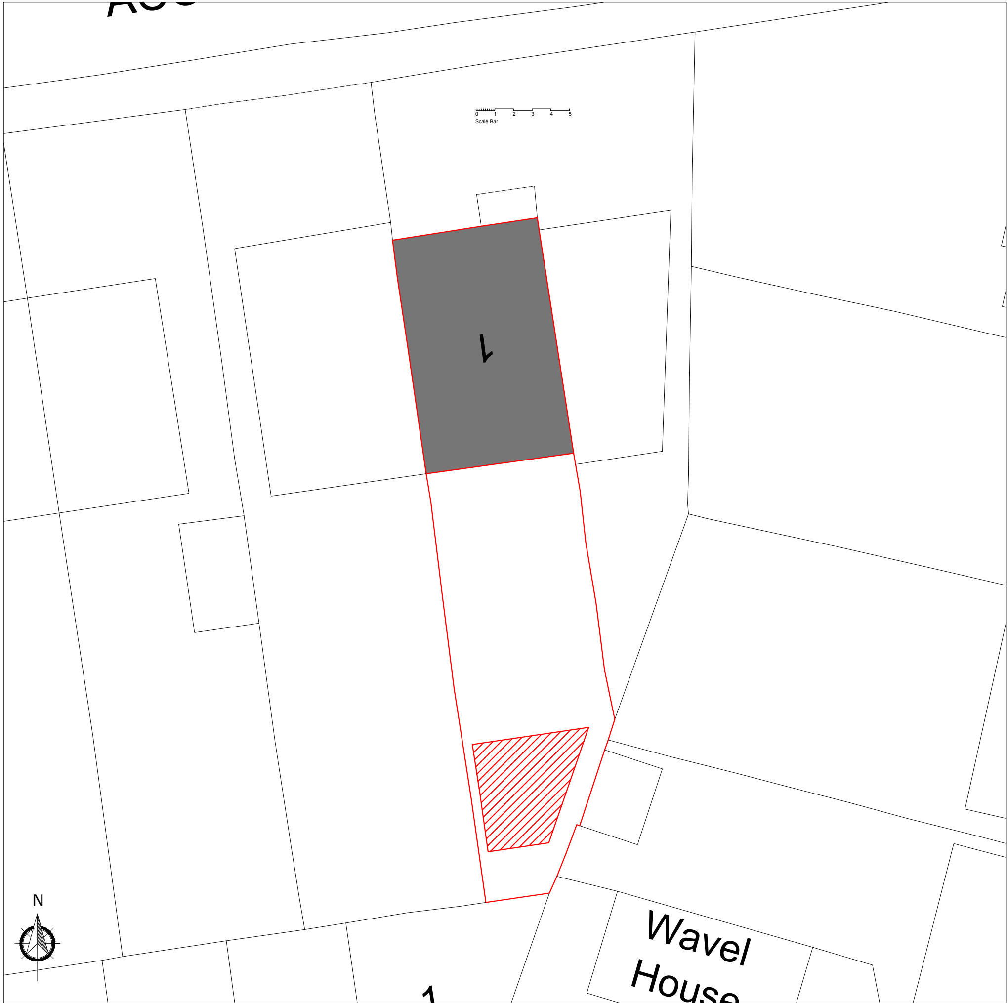
Block Plan 1:200