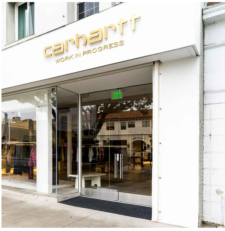
Brass Carhartt Script Reference

"WORK IN PROGRESS" lettering Each letter is 5.1 cm high Each letter is 2 mm thick and 3/5 cm distant from the wall.