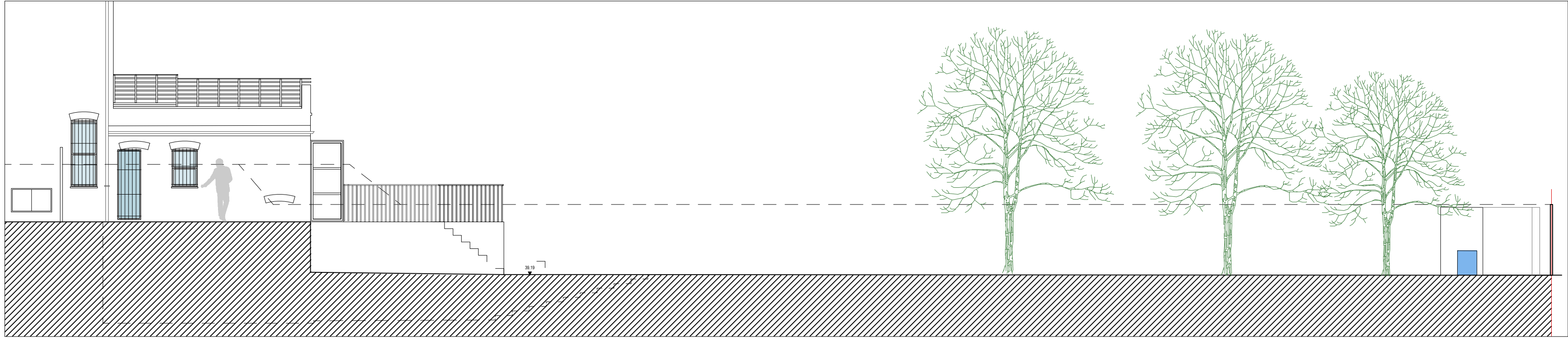
2 Proposed Rear Garden Longitudinal Section scale 1:100