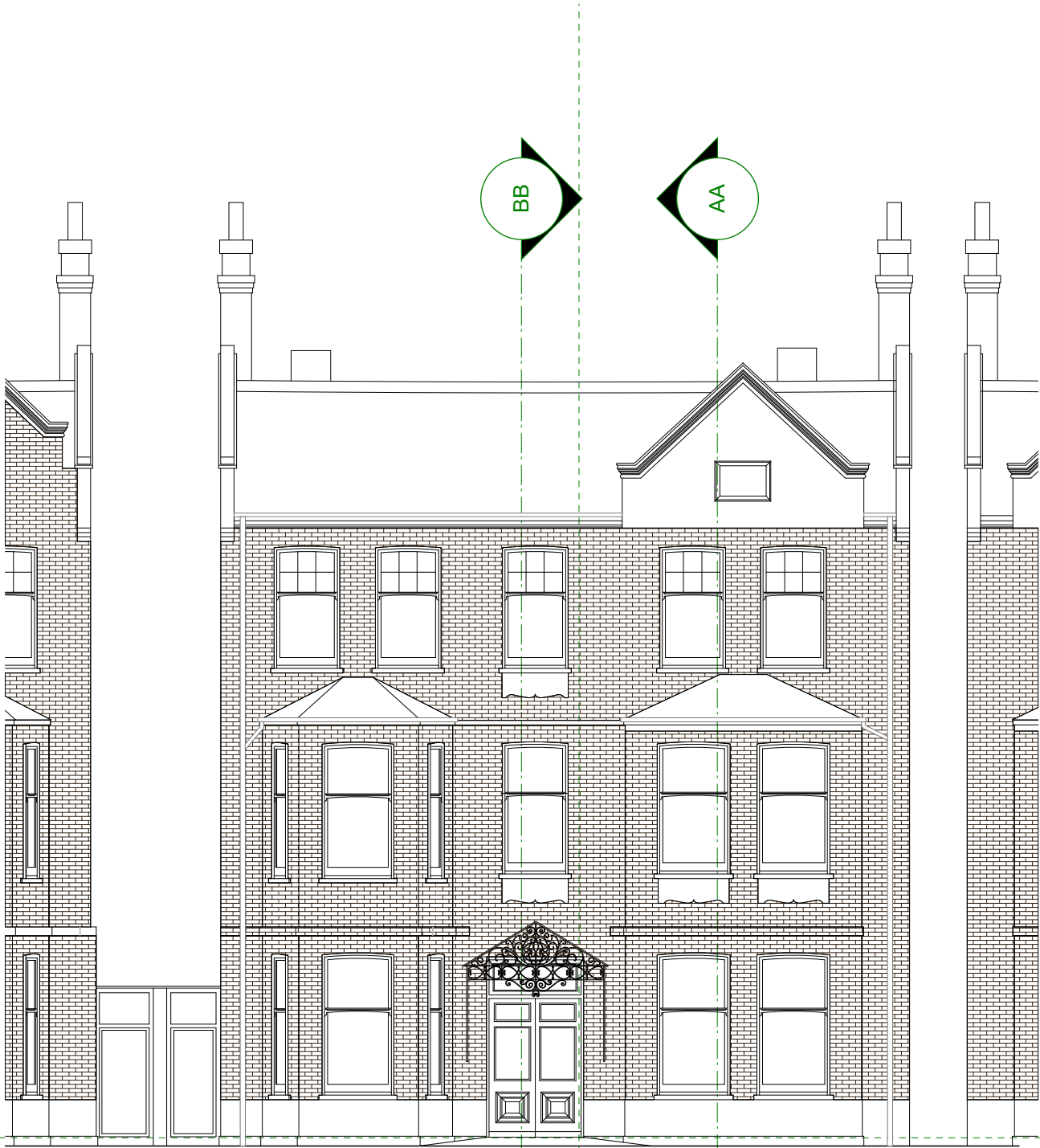
07 FRONT ELEVATION Scale: 1:100

COPYRIGHT AND LIABILITY NOTES: The design and drawings remain the property of Peek Architecture + Design. The client for this project will be licensed to use this design and documents on this site only upon full payment of architectural fees. This license is non-transferable. The design and drawings shall not be reproduced, up-loaded to the internet or traced without the permission of Peek Architecture + Design. This drawing has been prepared from a survey drawing from Peek Architecture and Design Ltd commissioned by the client. It is VERY IMPORTANT that all dimensions are checked carefully before any work commences or any materials are ordered. If any discrepancies are noticed between this drawing and any other contract document then please contact Peek Architecture + Design immediately. DO NOT SCALE USE FIGURED DIMENSIONS ONLY All dimensions to be verified on site prior to the commencement of any work or the production of any shop drawing. This drawing to be read in conjunction with all related Architect's and Engineer's drawings and any other relevant information. GENERAL NOTES: