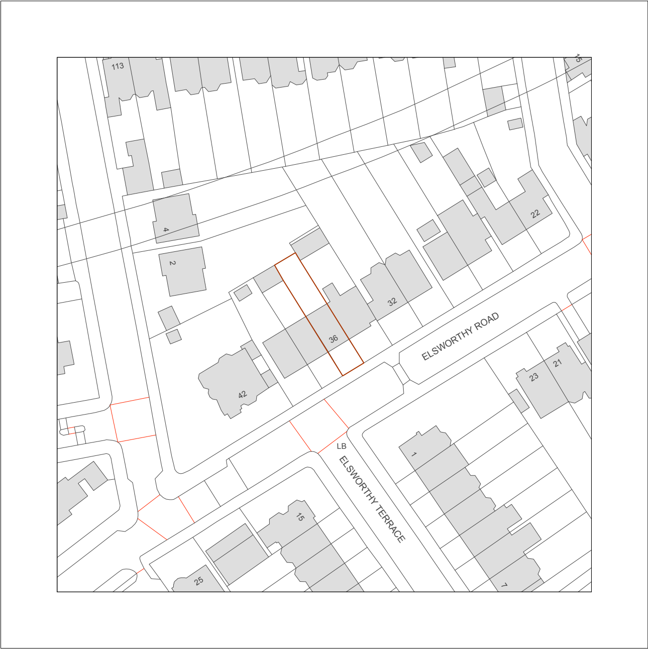
1 ELSWORTHY ROAD - OS LOCATION PLAN Scale: 1:500