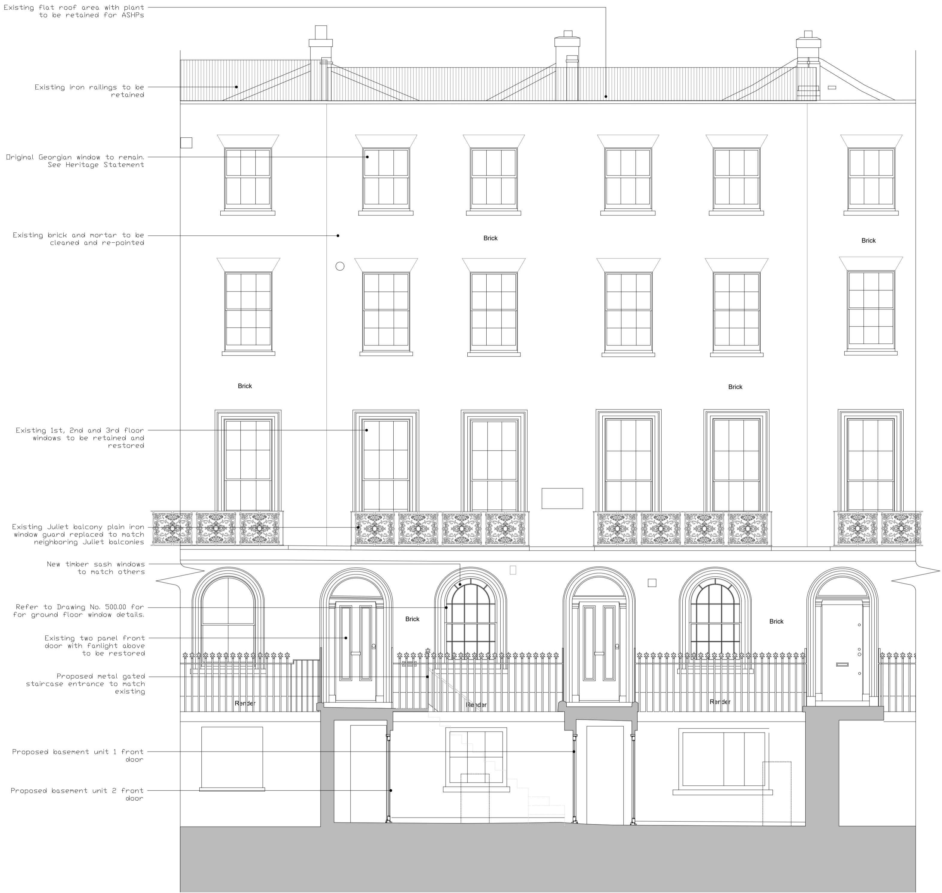
Proposed north facing front elevation