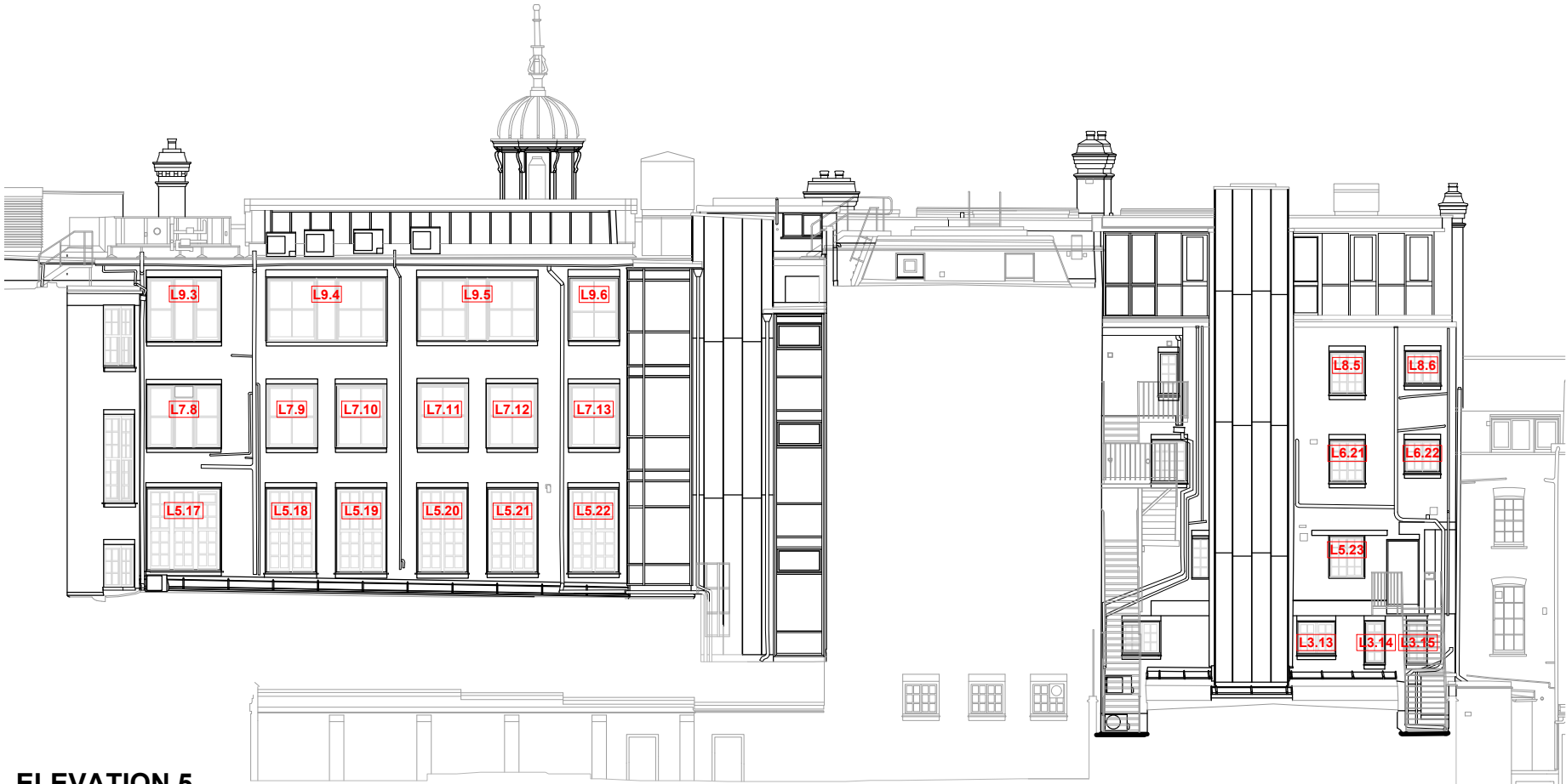
ELEVATION 5 Existing window design.