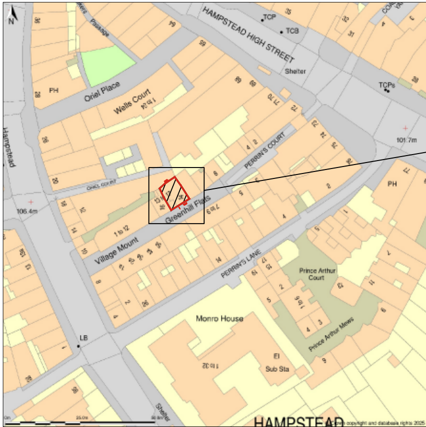
Site Plan Scale 1:1250