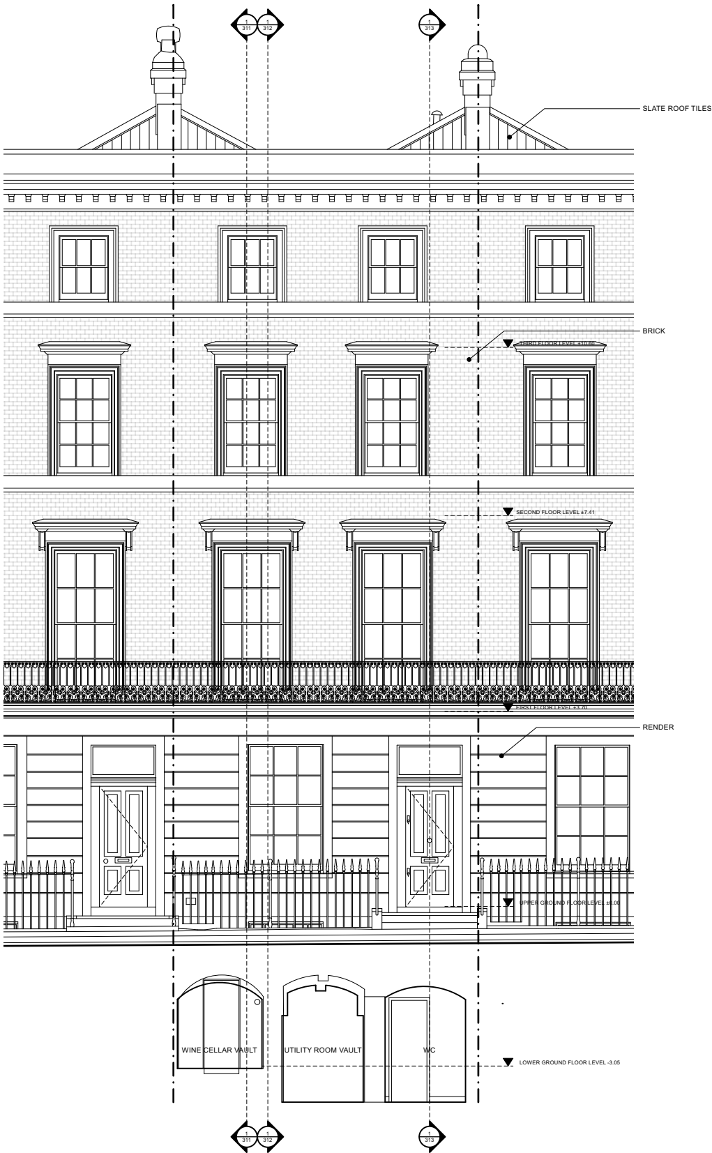
1 Front Elevation Scale: 1:100